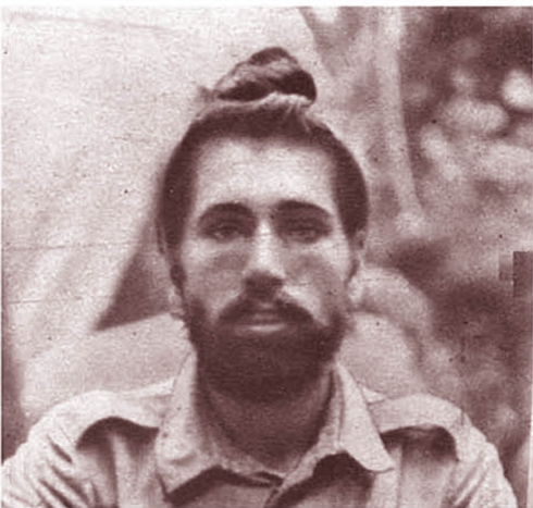
Knotty problem this Indian hair-do, as you can see by the "before and after" pictures.