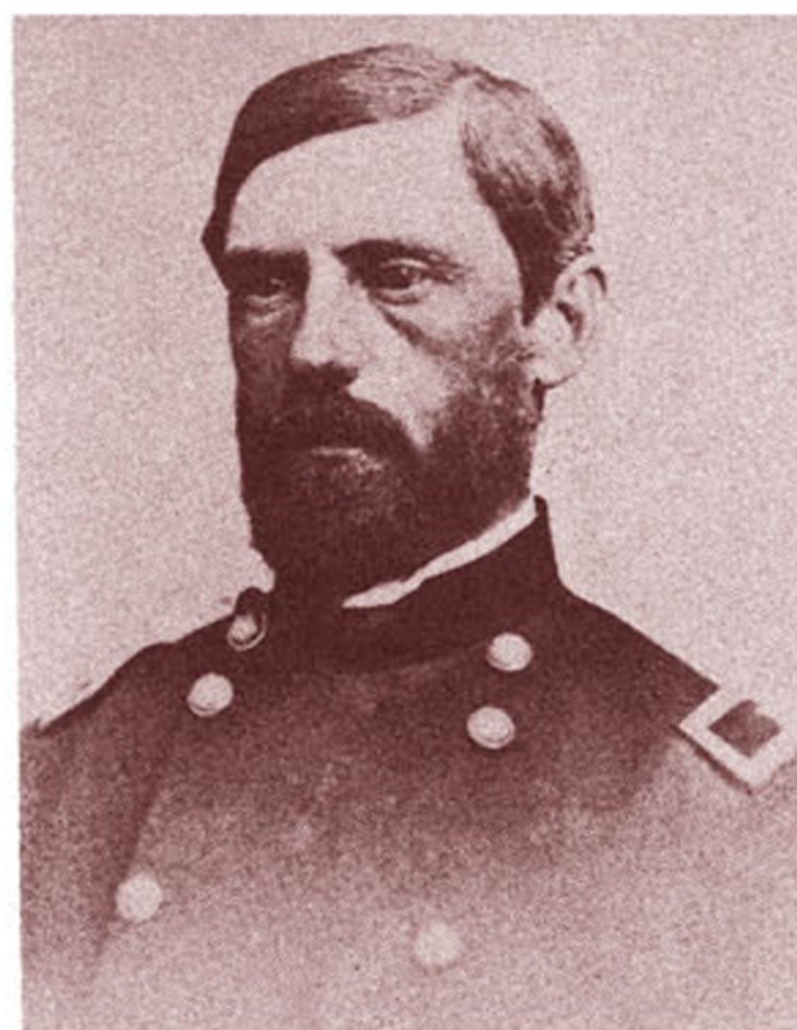
Maj. Gen. John F. Reynolds.

In the intervening 2 days since he had assumed command of the Union forces, General Meade had moved his troops northward and instructed his engineers to survey a defensive battle position at Pipe Creek, near Taneytown, in northern Maryland. Buford's cavalry, which had effectively shadowed Lee's advance from the mountaintops of the Blue Ridge, was ordered to make a reconnaissance in the Gettysburg area. It was