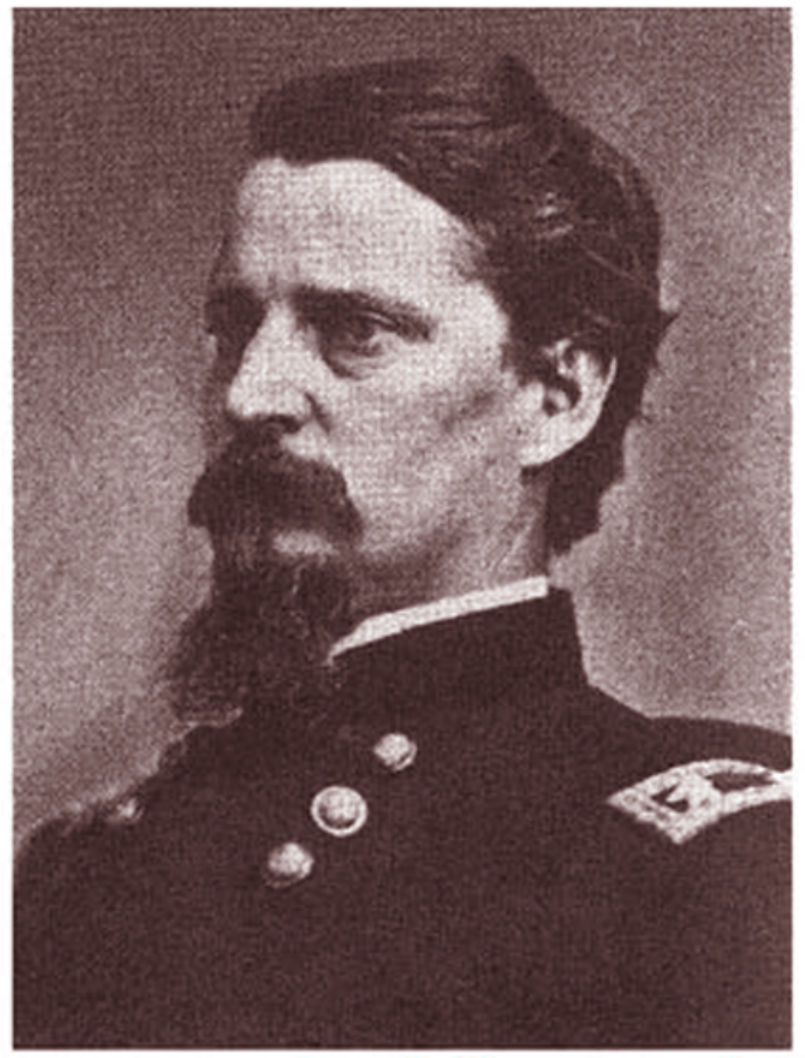
Maj. Gen. Winfield S. Hancock.

Ewell was now in possession of the town, and he extended his line from the streets eastward to Rock Creek. Studiously observing the hills in his front, he came within range of a Union sharpshooter, for suddenly he heard the thud of a minie ball. Calmly riding on, he remarked to General Gordon at his side, "You see how much better fixed for a fight I am than you are. It don't hurt at all to be shot in a wooden leg."