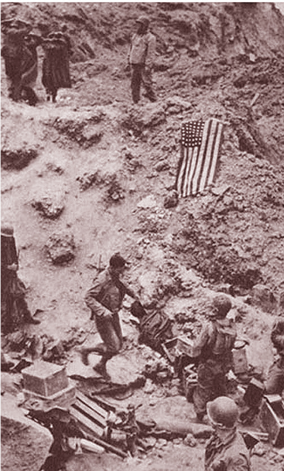
They had anchored the flag to the cliff with rocks

the Brady Aviation Plant of the Intercontinental Manufacturing Company, Inc., where he is vice-president. He is on the State Democratic Committee and the State Board of Welfare, and for six years was mayor of Brady.