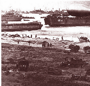
It was quiet on the deserted beach, with just the soft rhythmic slur of the waves and the occasional cry of a wheeling gull. "I want you to try to picture this, Bud," Rudder said, "... this whole beach covered with boats and trucks and jeeps and tanks, a lot of them wrecked . . ."

"Can I go in this one?" the boy said. "You can get in, and there's a big machine gun here."