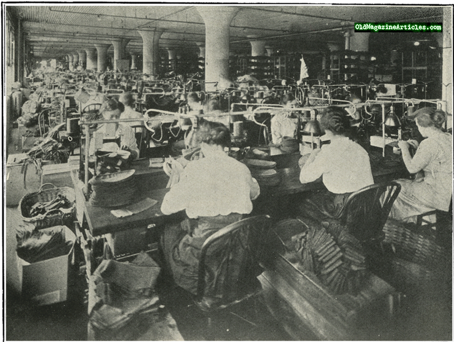
SEWING OVERSEAS CAPS IN A ST. PAUL, MINN., FACTORY.