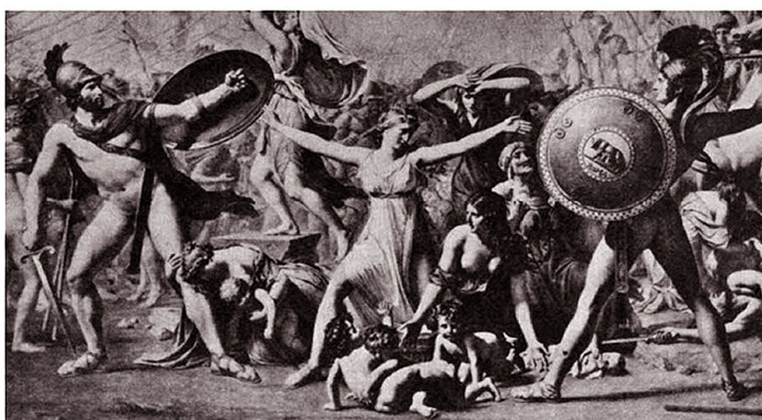
WAACs is nothing new.

If a general used to be especially well off he would get himself a elephant or maybe half a dozen elephants and throw them in with everything else but elephants is touchy beasts and inclined to run the wrong way so they give them up and went back to horses which they should of used in the first place. Hannibal for instant used elephants and where is