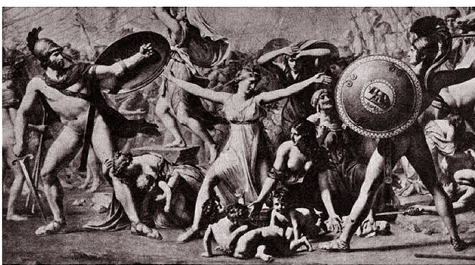
WAACs is nothing new.

If a general used to be especially well off he would get himself a elephant or maybe half a dozen elephants and throw them in with everything else but elephants is touchy beasts and inclined to run the wrong way so they give them up and went back to horses which they should of used in the first place. Hannibal for instant used elephants and where is