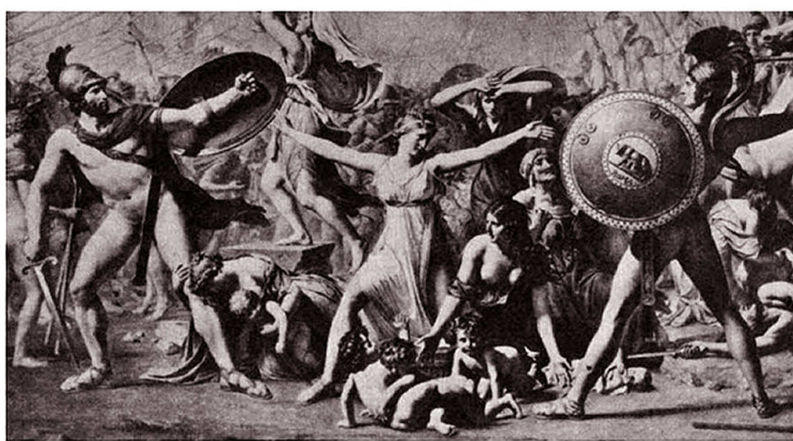
WAACs is nothing new.

If a general used to be especially well off he would get himself a elephant or maybe half a dozen elephants and throw them in with everything else but elephants is touchy beasts and inclined to run the wrong way so they give them up and went back to horses which they should of used in the first place. Hannibal for instant used elephants and where is