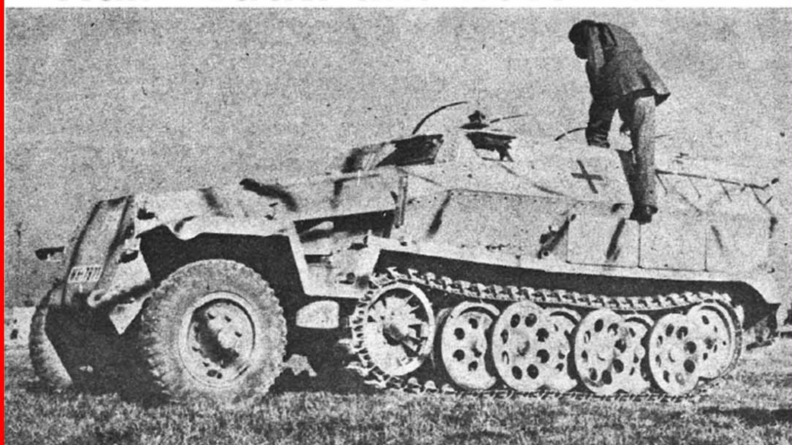
The German armored half-track personnel carrier is a six-cylinder, 100-horsepower job with a maximum speed of 40 mph. It carries two MG34 machine guns. This vehicle has a coffin-shaped body, and carries 10 men on two longitudinal seats. One machine gun is mounted to the right of the eleventh man, the driver, whose visibility is limited to two small glassed-in slots as shown above.