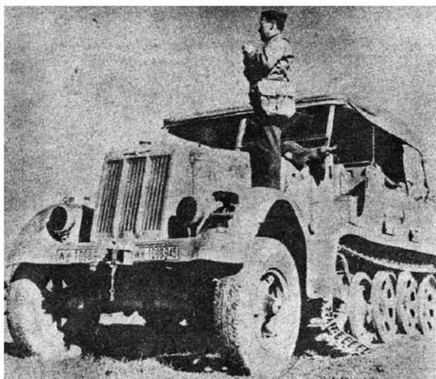
This is the German eight-ton half-track personnel carrier and prime mover. It has a passenger capacity of 12 men and is used as the standard tractor for the 88-mm dual-purpose gun.