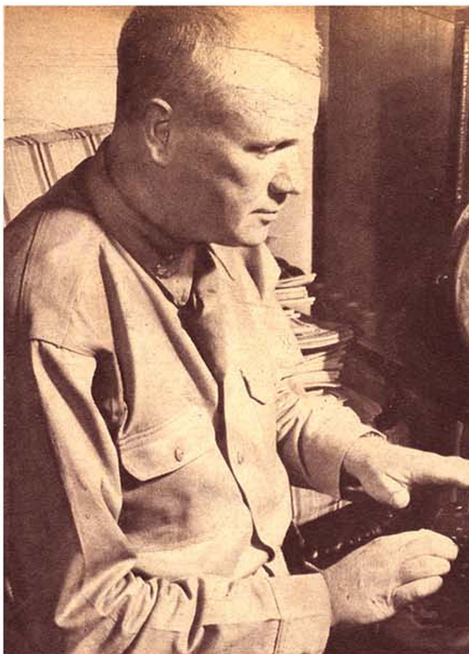
VINCENT SHEEAN, now a Lieut. Colonel in the Air Force, earned the envy of all of his troops—not because of the adventurous life he has led, not because of successful books he has written, but because Betty Grable chose him as the One Man she'd like to blind date.

"I ought to," Vincent Sheean sighed. "My wife and I spent our honeymoon here."