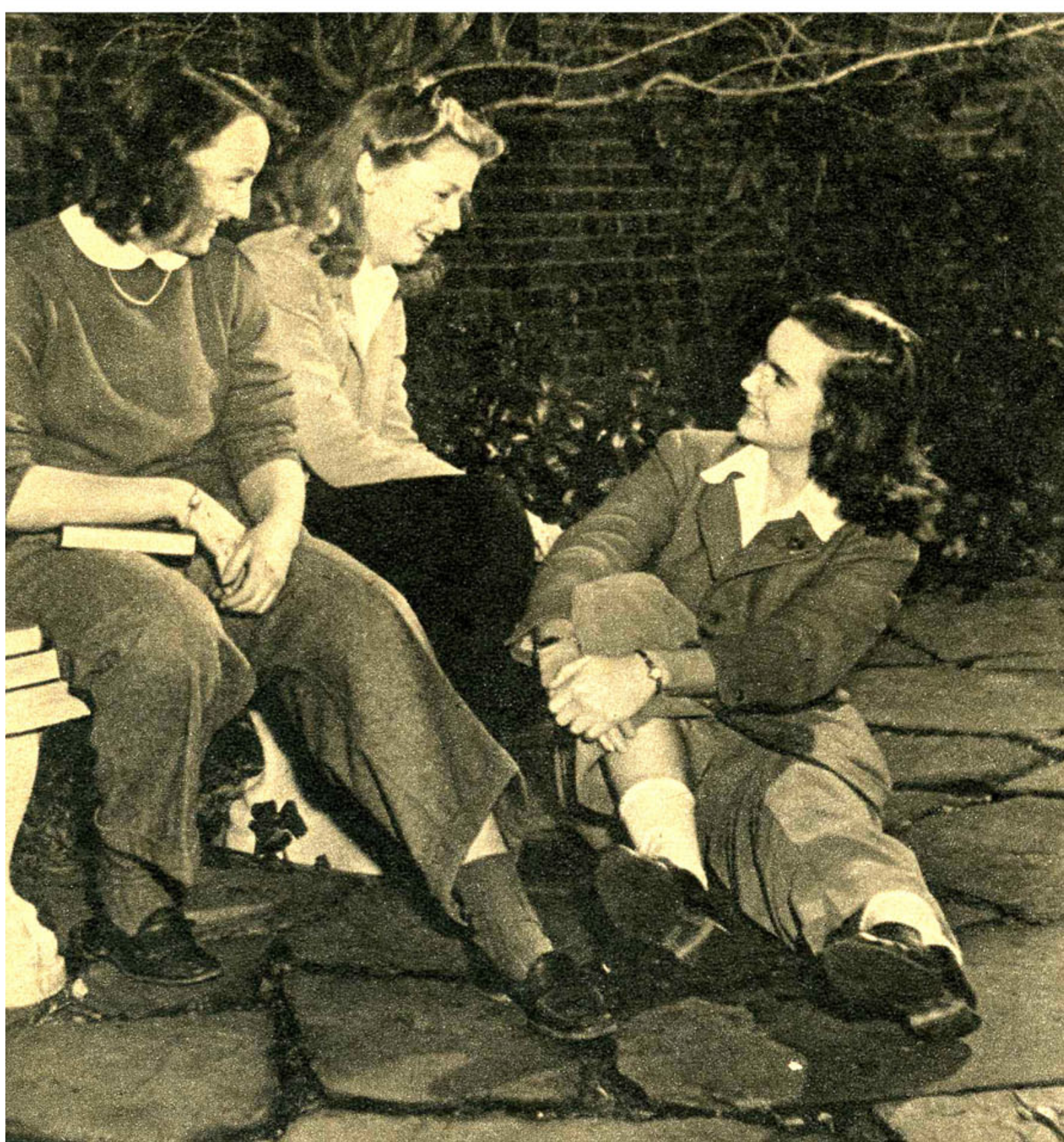
Parental and male objections notwithstanding, slacks are demonstrably appropriate for such strictly feminine pastimes as gossip fests in the yard during recess.