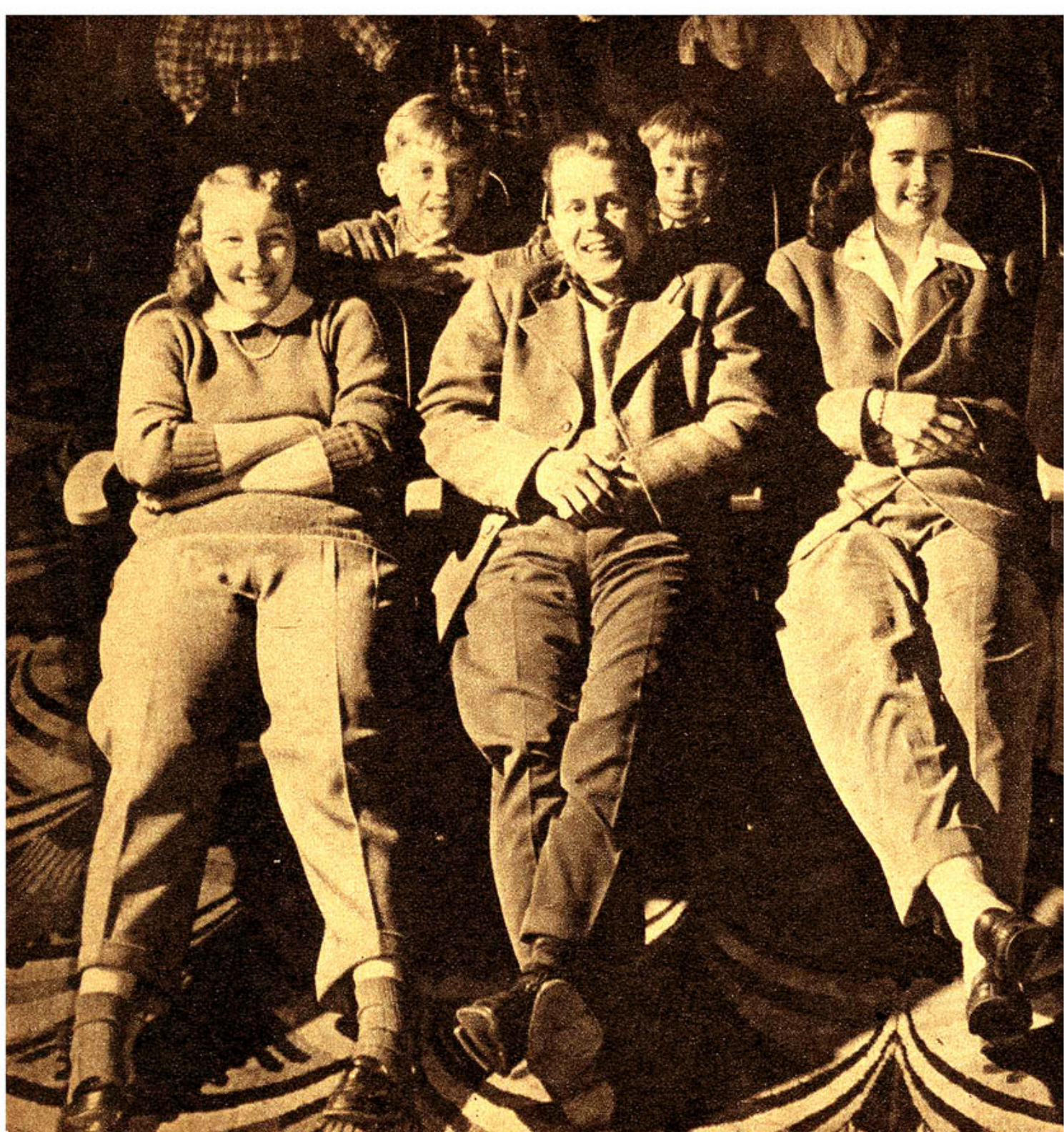
AS THEY DO IN HOLLYWOOD, ENGLEWOOD GIRLS WEAR SLACKS AT NIGHT, HERE RELAX HAPPILY AT THE NEARBY TEANECK THEATRE