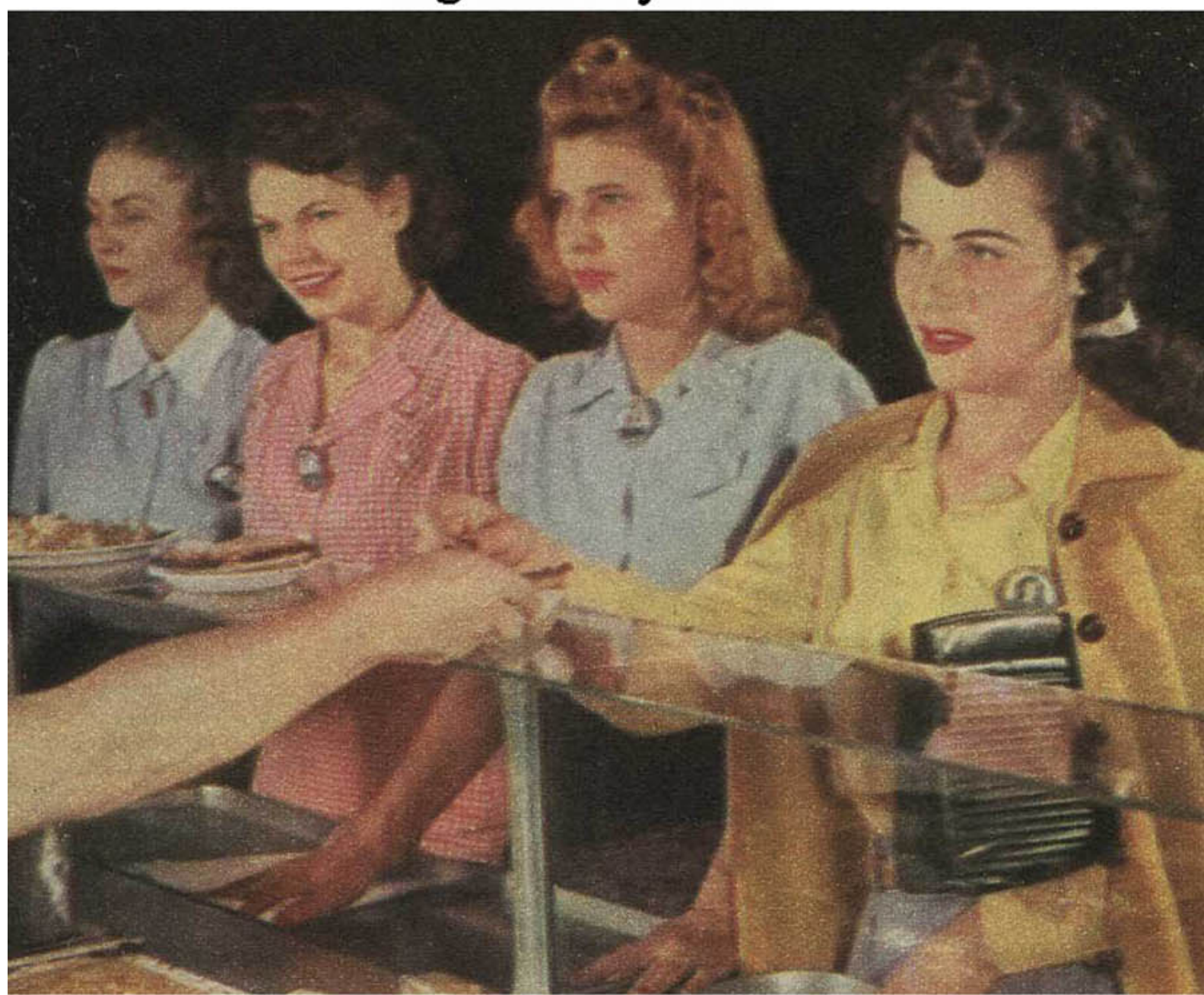
Her lunch at the company cafeteria usually includes a ham sandwich, potato salad, apple pie & coffee