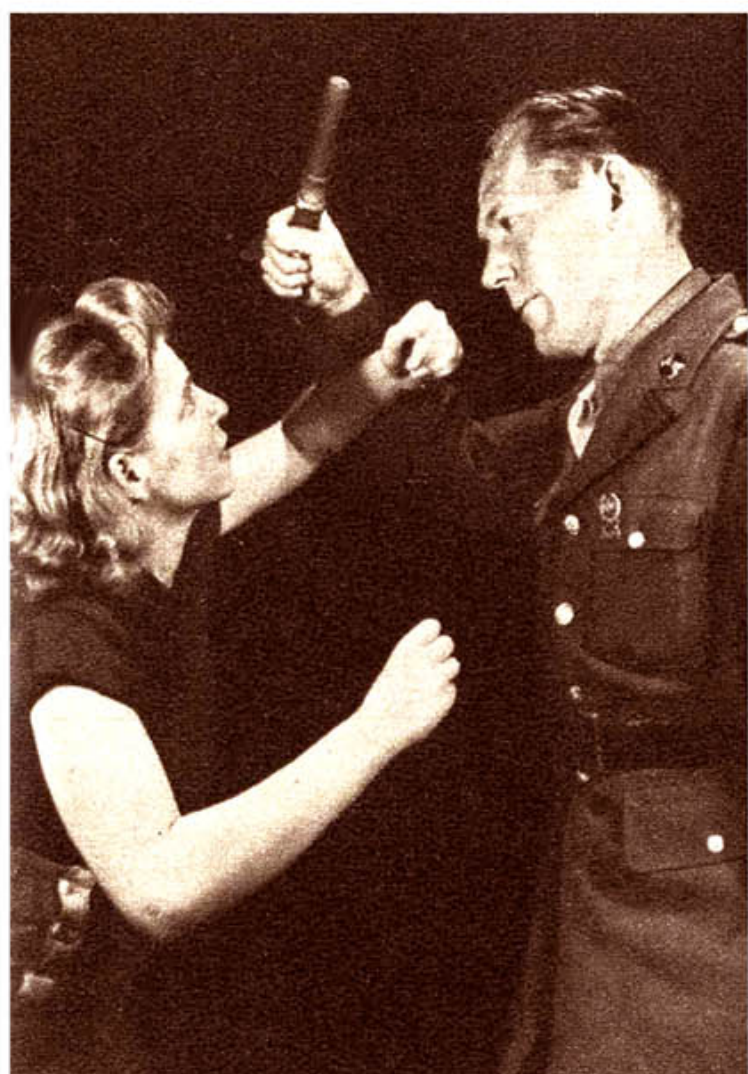
How Gale parries a club blow. Twisting to the left, she sweeps her left arm upward, grabs attacker's right wrist