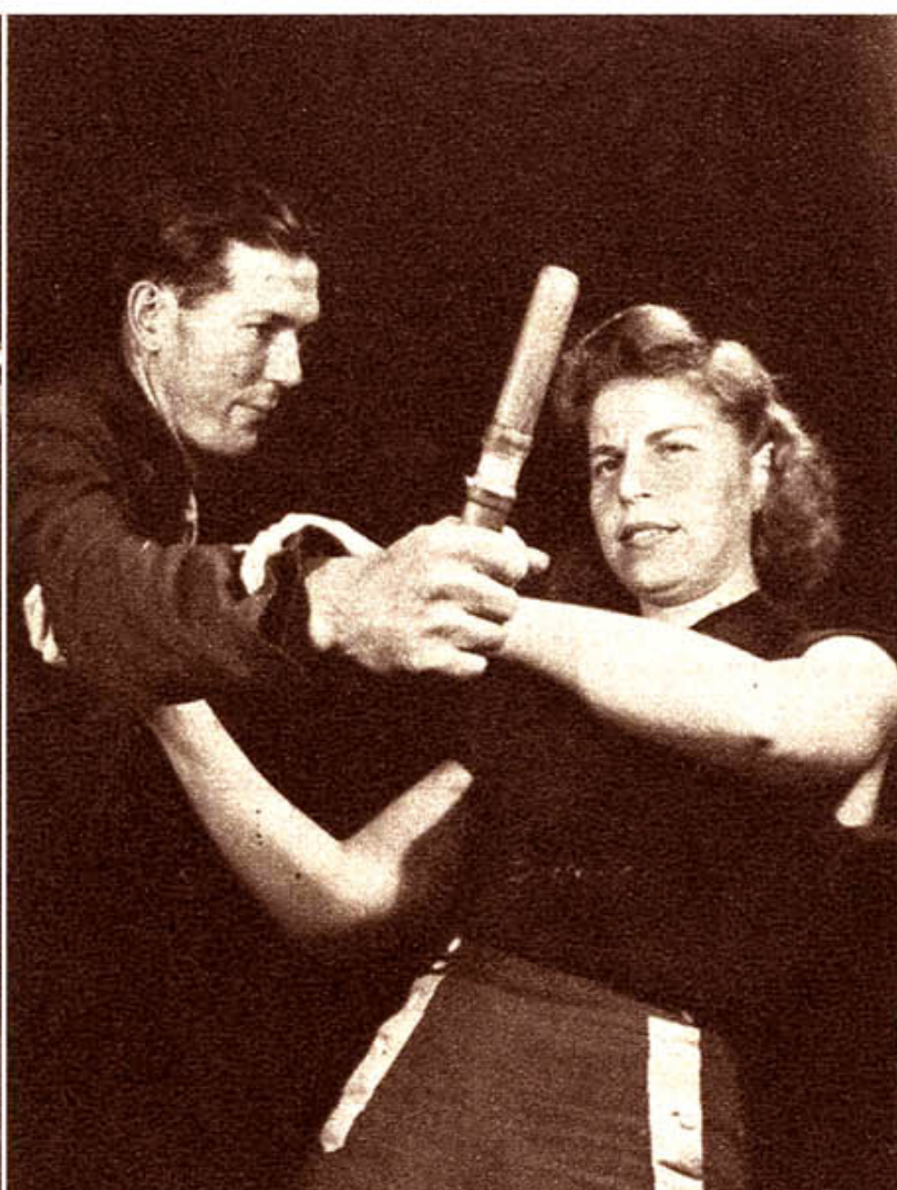
Her right hand grips his right upper arm from underneath. Locks her right foot against her attacker's right foot