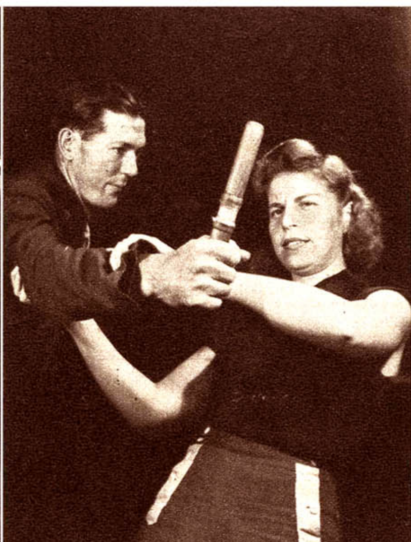
Her right hand grips his right upper arm from underneath. Locks her right foot against her attacker's right foot