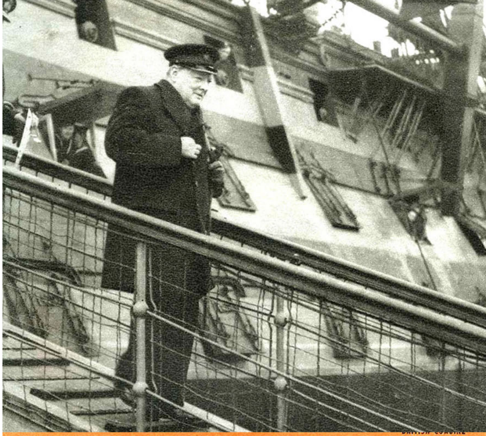
At Portsmouth with Admiral Sir William James after a bombing. Ship in background is Nelson's famous Victory. Below, with high-ranking army officials, Churchill inspects England's first-line coastal defenses