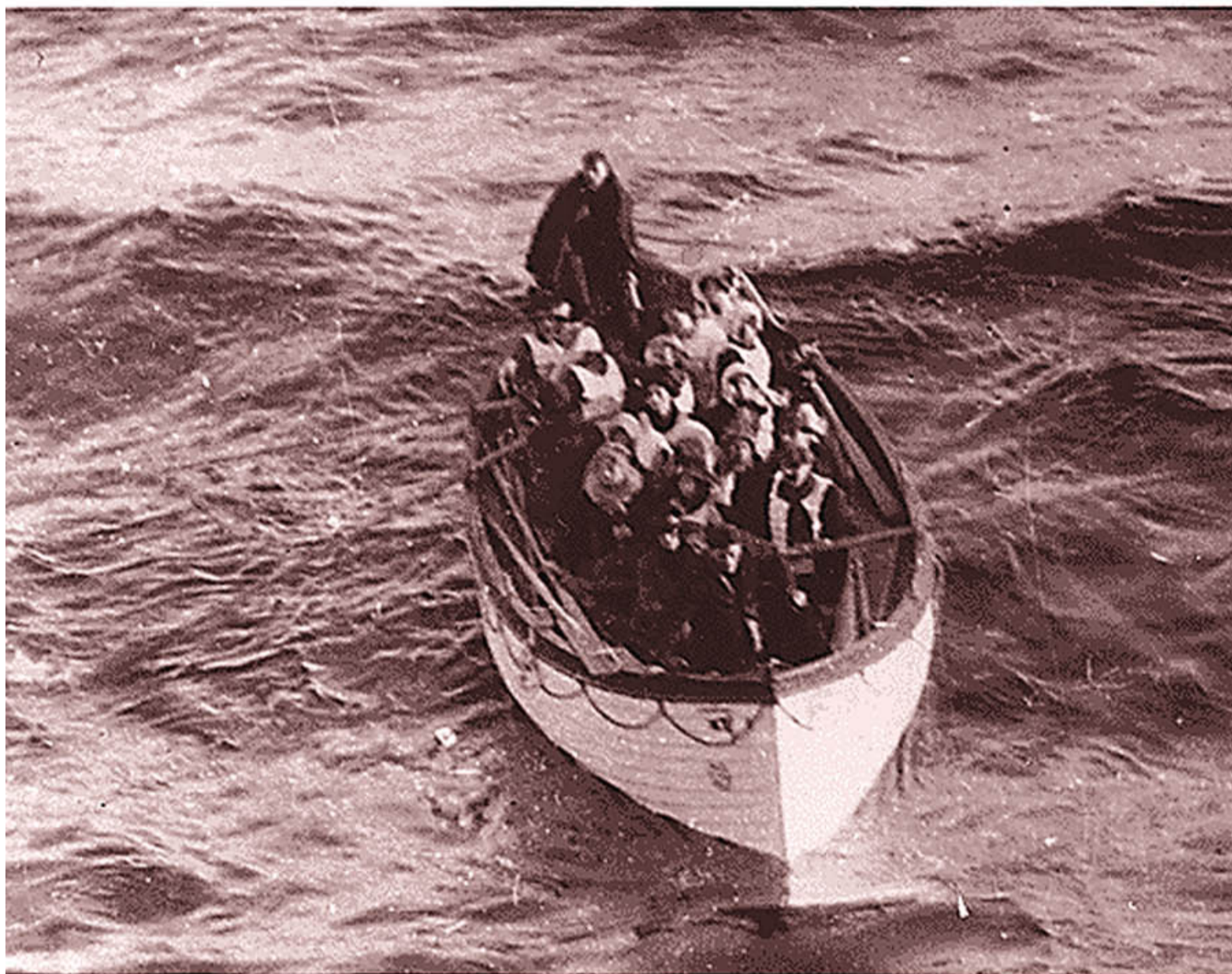
ONE OF THE "TITANIC'S" LIFE-BOATS APPROACHING THE "CARPATHIA," BARELY HALF FULL.

"The Titanic inquest is being held here because, as one of the members of Parliament suggested yesterday, many American citizens lost their lives in the disaster. . . . Nor can there be any valid denial of the right of this Government to investigate the equipment and conduct of foreign ships which seek the use of its ports and the patronage of its citizens, and in so doing to ask questions of any of the alien owners and officers of those ships whom it may happen to find within its jurisdiction."