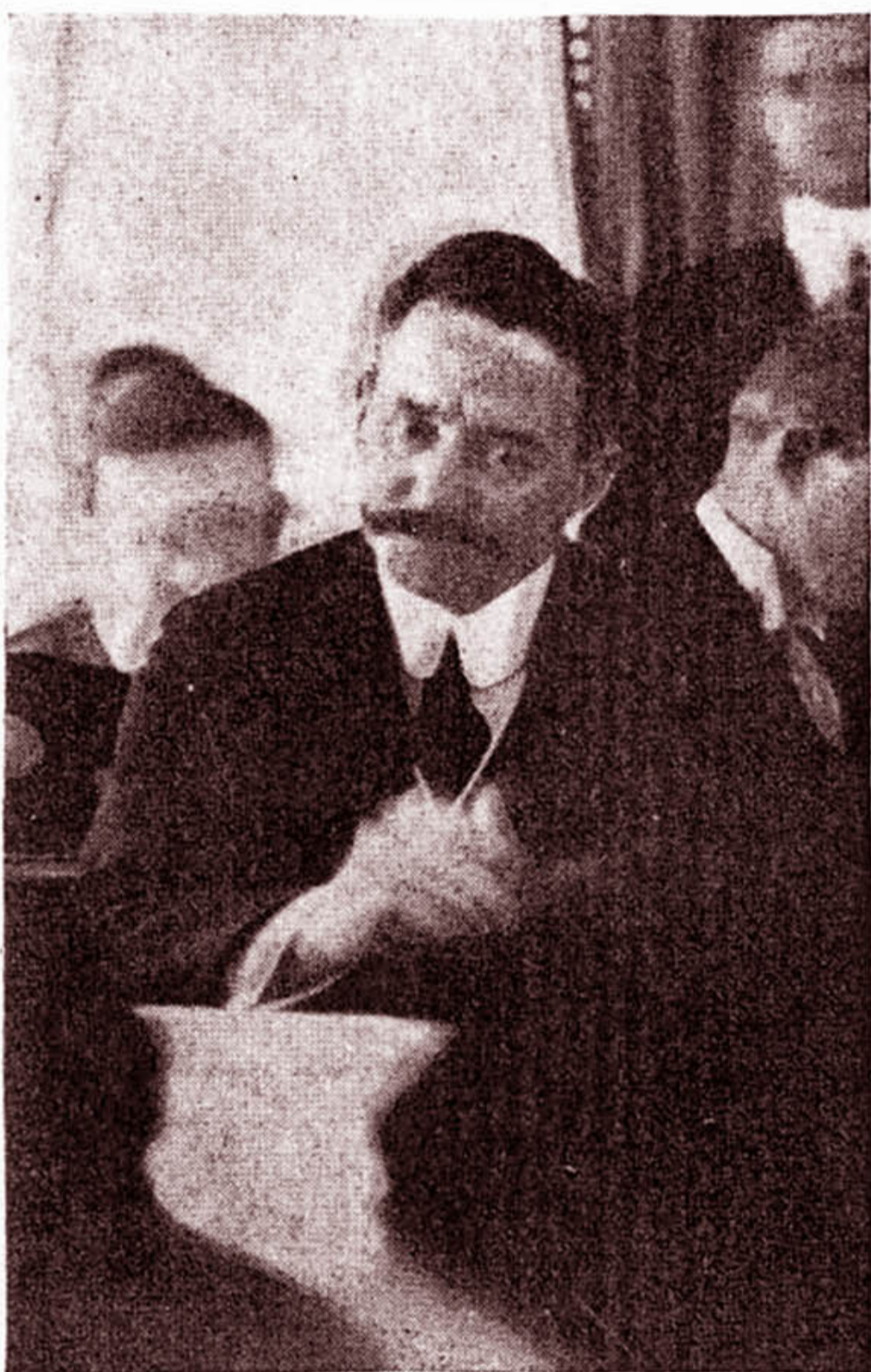
MR. JOSEPH BRUCE ISMAY,

President of the International Mercantile Marine Company, testifying before the committee of investigation. He declares the wreck of the Titanic has taught him a lesson.