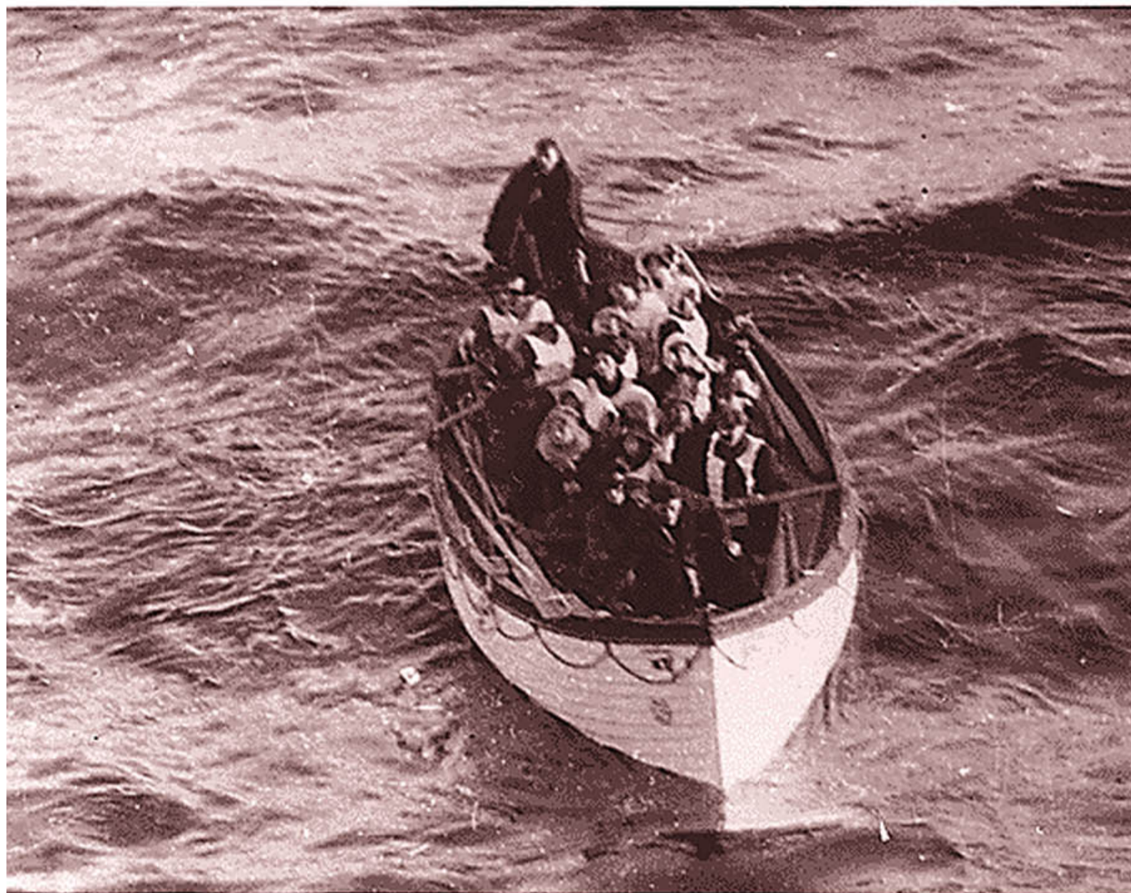
ONE OF THE "TITANIC'S" LIFE-BOATS APPROACHING THE "CARPATHIA," BARELY HALF FULL.

"The Titanic inquest is being held here because, as one of the members of Parliament suggested yesterday, many American citizens lost their lives in the disaster. . . . Nor can there be any valid denial of the right of this Government to investigate the equipment and conduct of foreign ships which seek the use of its ports and the patronage of its citizens, and in so doing to ask questions of any of the alien owners and officers of those ships whom it may happen to find within its jurisdiction."