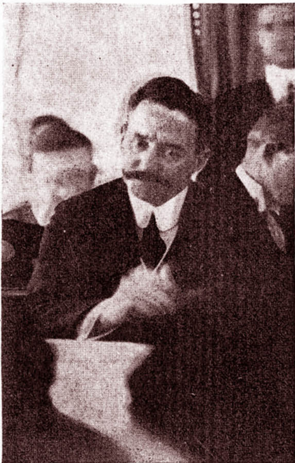
MR. JOSEPH BRUCE ISMAY,

President of the International Mercantile Marine Company, testifying before the committee of investigation. He declares the wreck of the Titanic has taught him a lesson.