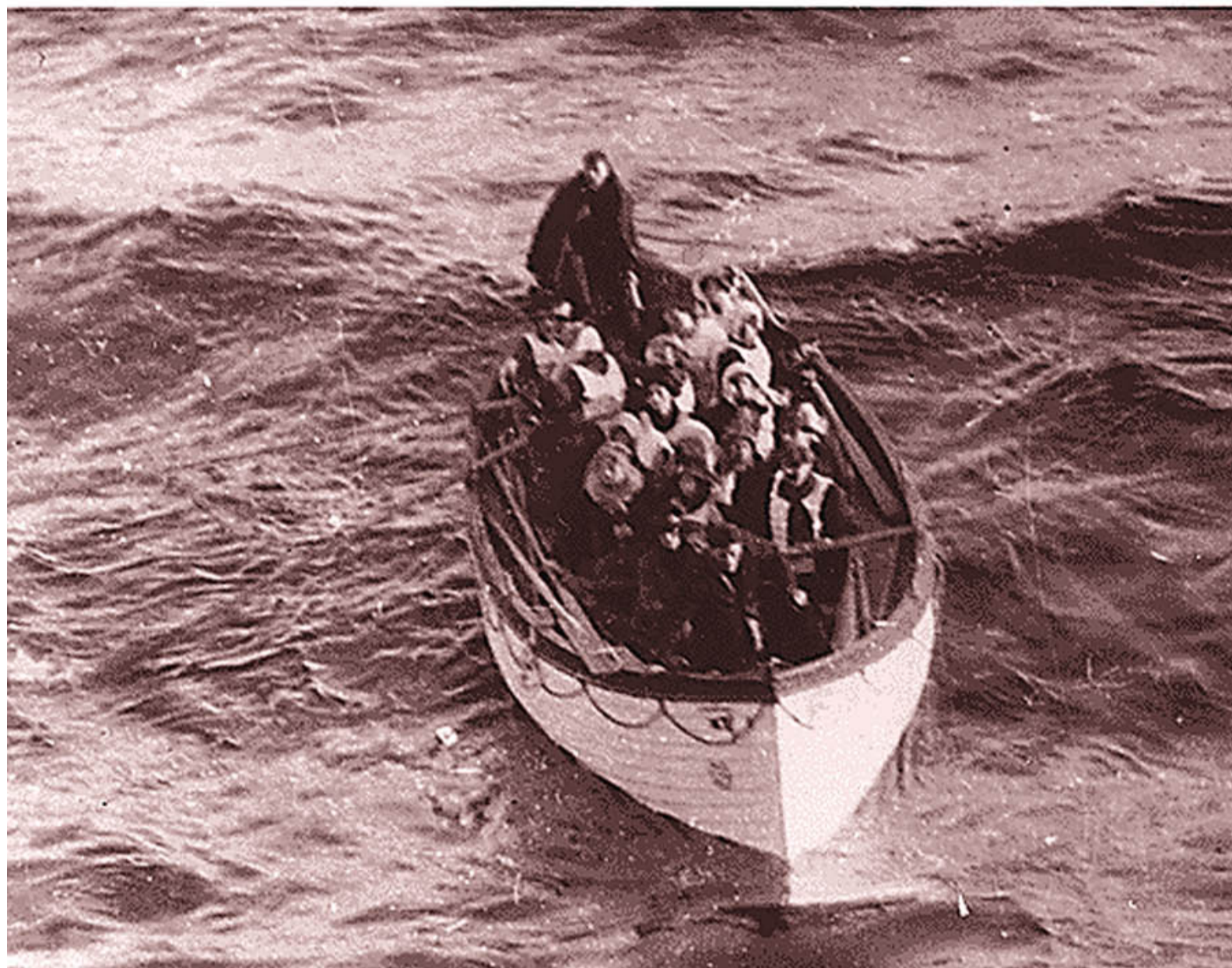
ONE OF THE "TITANIC'S" LIFE-BOATS APPROACHING THE "CARPATHIA," BARELY HALF FULL.

"The Titanic inquest is being held here because, as one of the members of Parliament suggested yesterday, many American citizens lost their lives in the disaster. . . . Nor can there be any valid denial of the right of this Government to investigate the equipment and conduct of foreign ships which seek the use of its ports and the patronage of its citizens, and in so doing to ask questions of any of the alien owners and officers of those ships whom it may happen to find within its jurisdiction."