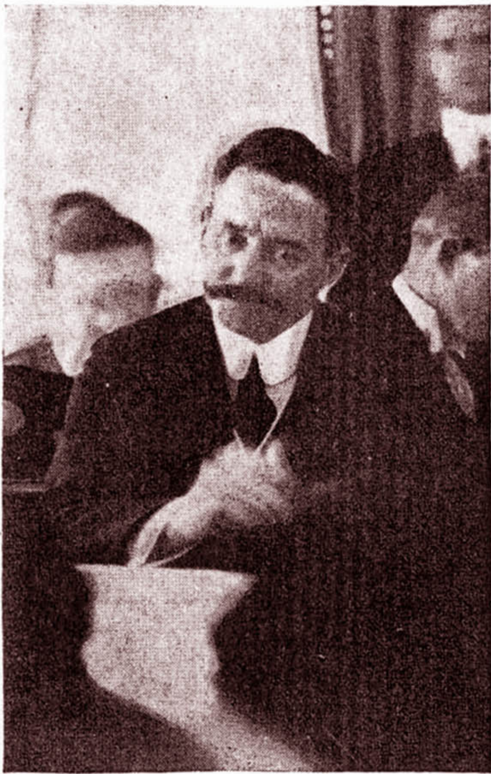
MR. JOSEPH BRUCE ISMAY,

President of the International Mercantile Marine Company, testifying before the committee of investigation. He declares the wreck of the Titanic has taught him a lesson.