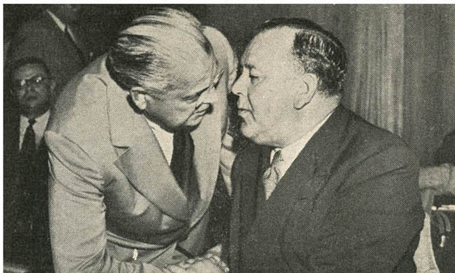
Security Council Huddle: U. S. Ambassador Austin, U.N. Sec. Lie.

Background : Russia called the U.N. action illegal on the ground that it had refused to take part in the Security Council sessions. But Russia had nullified its claim by conceding, in an earlier action, that refusal of a big power to take part didn't veto a Security Council decision. Moscow broadcast far and wide the charge that it was the South Koreans who provoked the war by launching an attack. This charge failed to hold up. A third of the South Korean Army was on leave when the fighting started.