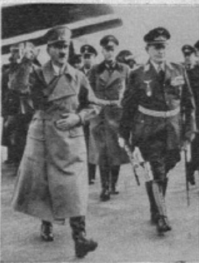
When this picture was taken, Adolf Hitler and Hermann Goering were on their way from the Munich airbase to attend the ceremonial state funeral of the Nazis killed when a bomb went off during the Nazi old-timers' celebration last year. Hitler, who barely escaped with his life then, fled to Berlin, returned two days later for the state funeral.

The Nazi Army, organized to last on the "Fuehrer Principle," when a group of Bols disguised as German high officers obtained the keys to Munich Prison in Berlin last night, and spirited Ernst Thaelman.