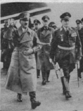
When this picture was taken, Adolf Hitler and Hermann Goering were on their way from the Munich airfield to attend the ceremonial state funeral of the Nazis killed when a bomb went off during the Nazi old-timers' celebration last year. Hitler, who barely escaped with his life then, fled to Berlin, returned two days later for the state funeral.

The Nazi Army, organized to last on the "Fuehrer Principle," when a group of Bols disguised as German high officers obtained the keys to Munich Prison in Berlin last night, the only deaths of Hitler and spirited Ernst Thaelman.