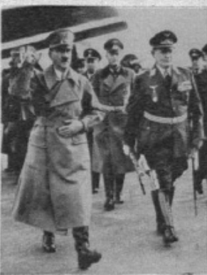
When this picture was taken, Adolf Hitler and Hermann Goering were on their way from the Munich airbase to attend the ceremonial state funeral of the Nazis killed when a bomb went off during the Nazi old-timers' celebration last year. Hitler, who barely escaped with his life then, fled to Berlin, returned two days later for the state funeral.

The Nazi Army, organized to last on the "Fuehrer Principle," when a group of Bols disguised as German high officers obtained the keys to Munich Prison in Berlin last night, and spirited Ernst Thaelman.