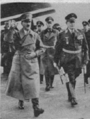
When this picture was taken, Adolf Hitler and Hermann Goering were on their way from the Munich airbase to attend the ceremonial state funeral of the Nazis killed when a bomb went off during the Nazi old-timers' celebration last year. Hitler, who barely escaped with his life then, fled to Berlin, returned two days later for the state

The Nazi Army, organized to last on the "Fuehrer Principle," when a group of Bols disguised as German high officers obtained the keys to Munich Prison in Berlin and spirited Ernst Thaelman.