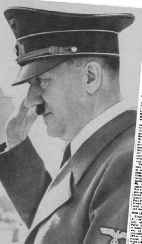
Goering Named Heir, Faces Opposition From More Fanatical Nazi Leaders

Special to The Inquirer LONDON, Aug. 1—The Duke of Windsor, who was in the city at the time, was also seen in the city. He said that he had seen Hitler and that he had spoken to him. He said that Hitler was a man of great power and that he had seen him in a very intimate way.