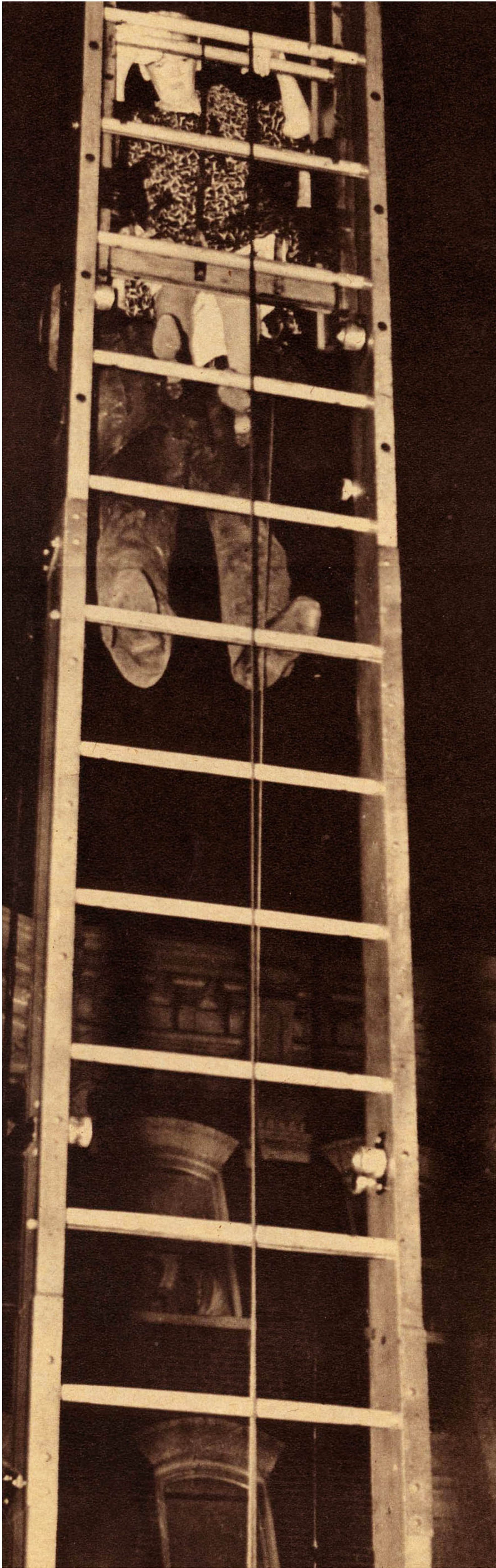
At a tenement-house fire in the Hell's Kitchen section after midnight, Weegee snapped a fireman rescuing an old woman.