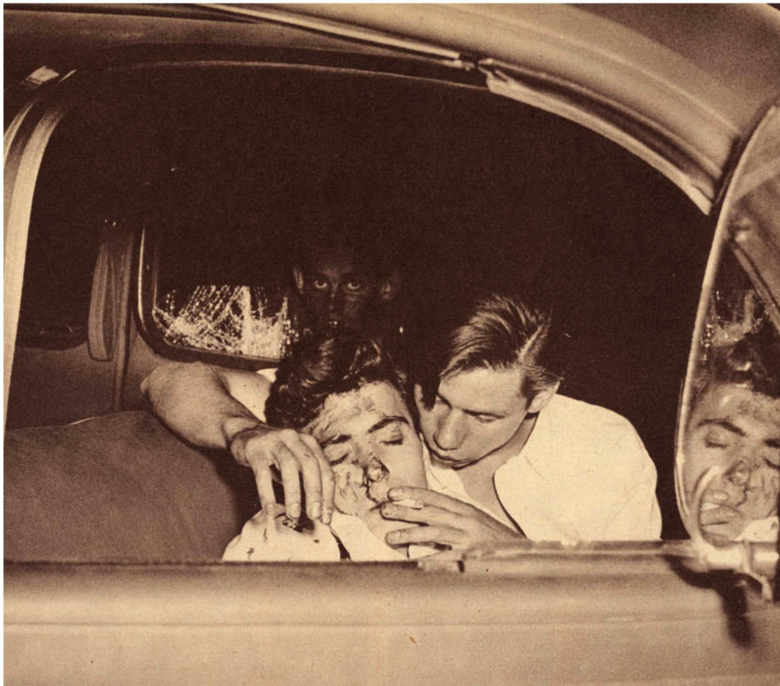
1 AM ON UPPER FIFTH AVENUE, WEEGEE CAUGHT THIS YOUNGSTER,

From 1 a. m. to 2 a. m.; People report prowlers on