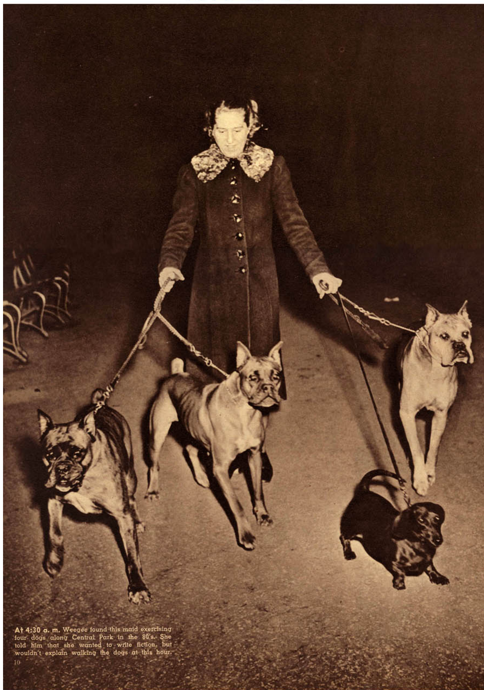
At 4:30 a. m. Weegee found this maid exercising four dogs along Central Park in the 80's. She told him that she wanted to write fiction, but wouldn't explain walking the dogs at this hour.