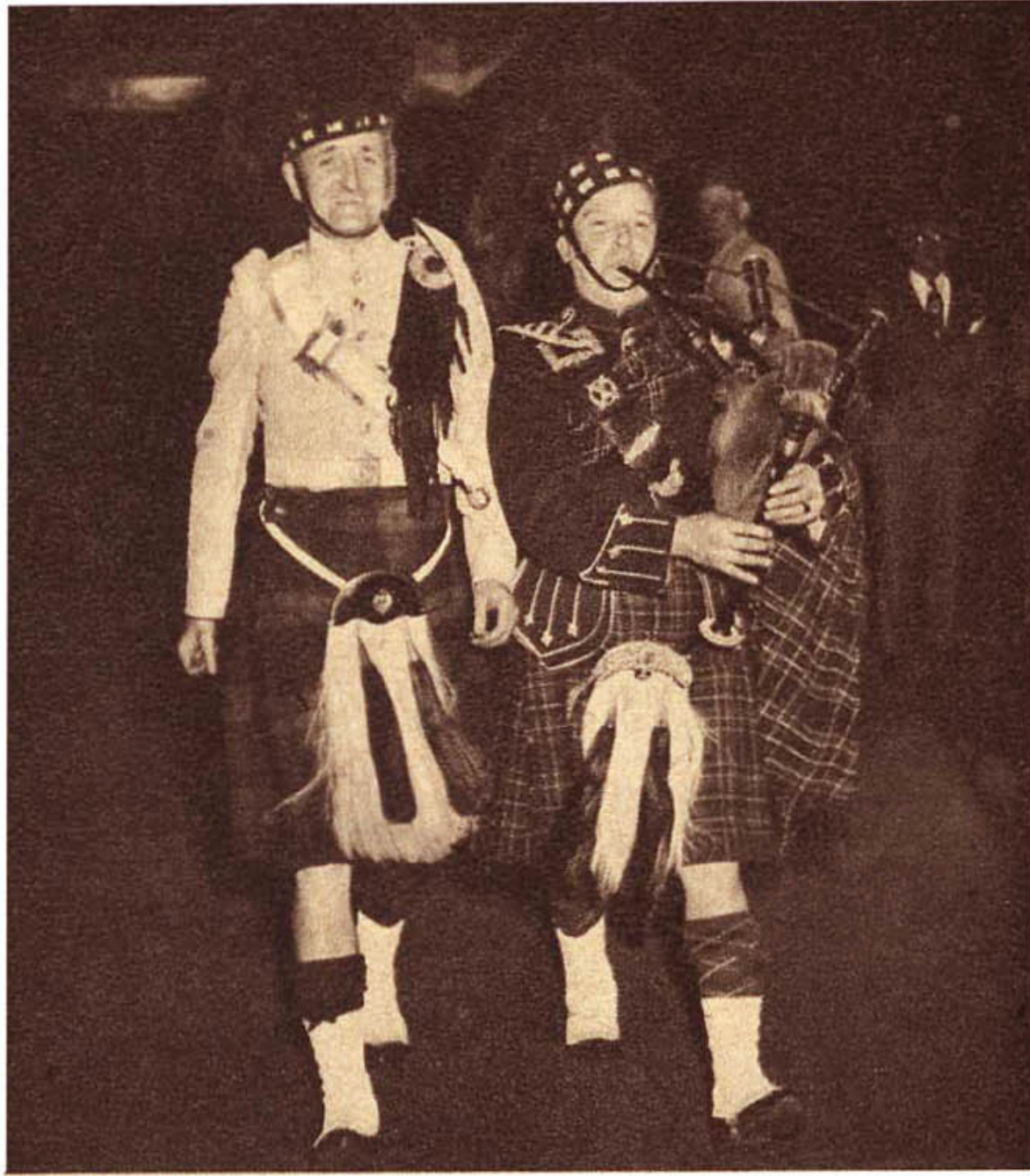
At 4 a. m. in Times Square, Weegee found these bagpipers on way from party to subway.