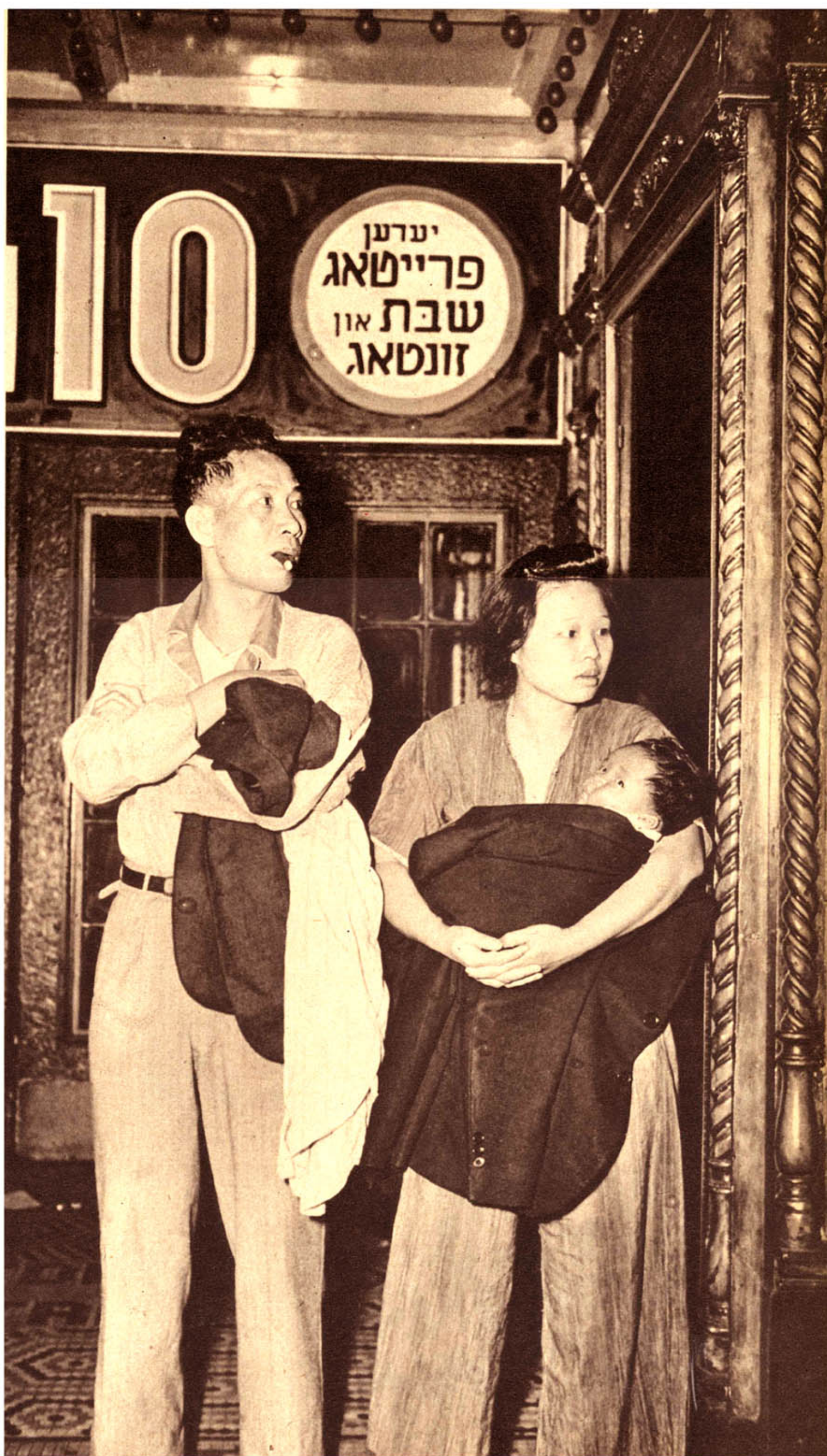
In the early hours of the morning, a Chinese couple and baby wait in the entrance of a Yiddish theatre on the Lower East Side while firemen fight blaze in their tenement.