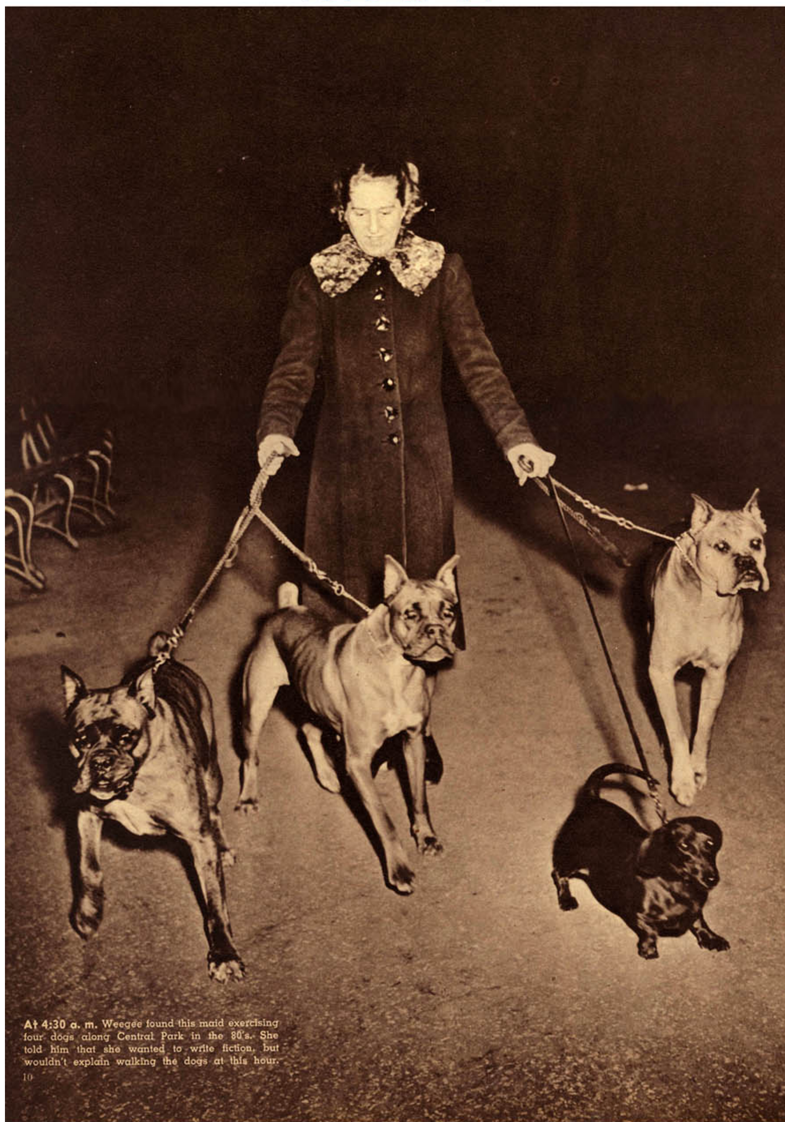
At 4:30 a. m. Weegee found this maid exercising four dogs along Central Park in the 80's. She told him that she wanted to write fiction, but wouldn't explain walking the dogs at this hour.