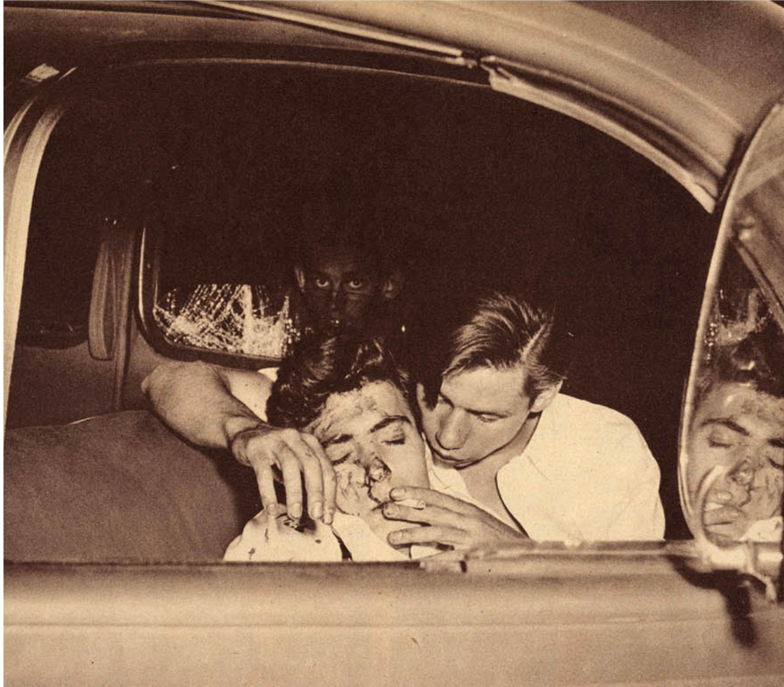
1 AM ON UPPER FIFTH AVENUE, WEEGEE CAUGHT THIS YOUNGSTER,

From 1 a. m. to 2 a. m.; People report prowlers on