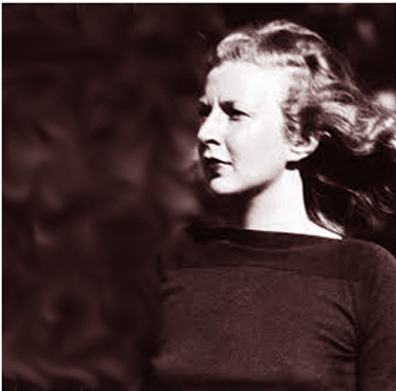
Martha Gellhorn, War Correspondent (image added)

And if ever again we tolerate such cruelty we have no right to peace.