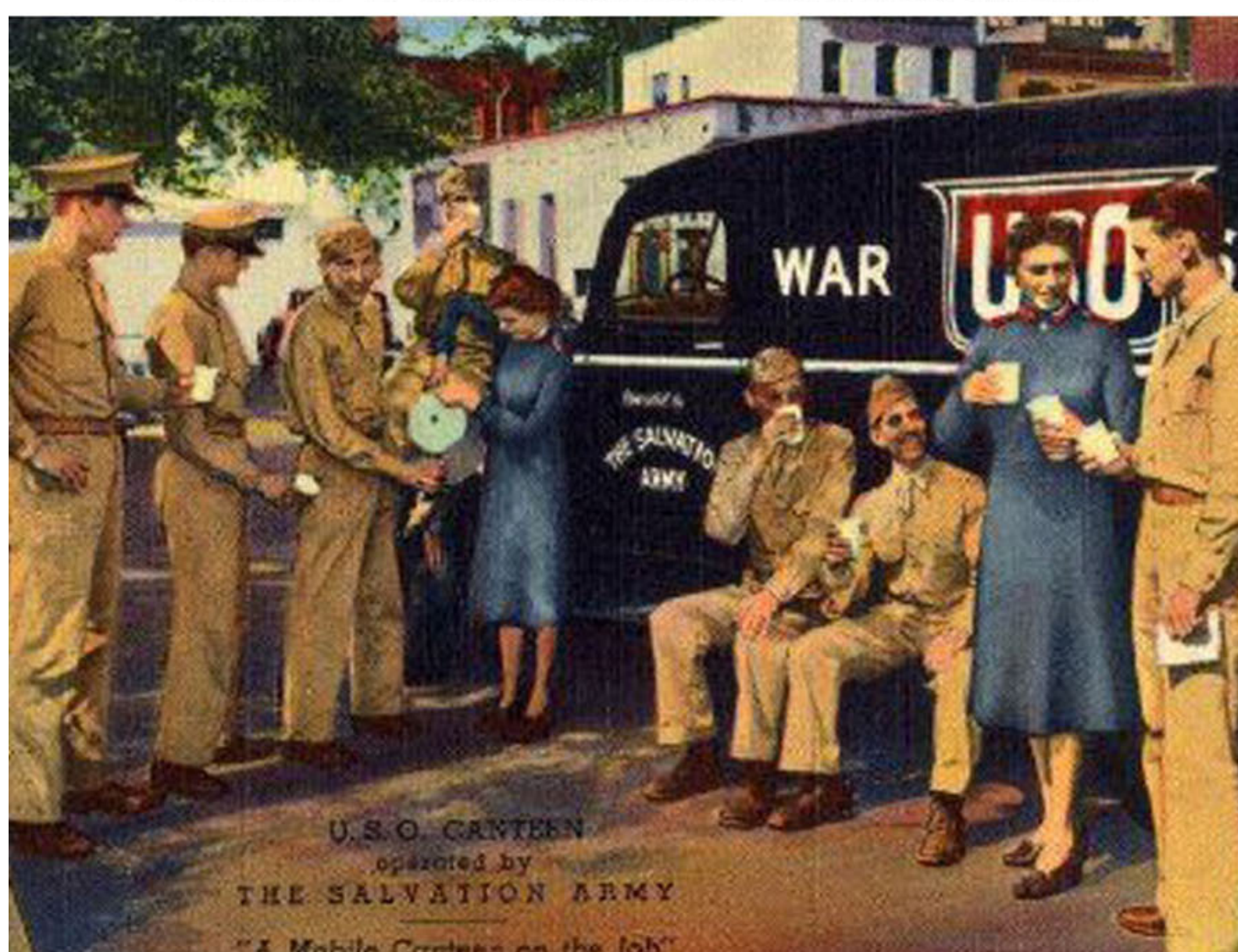
U.S.O. CANTEN operated by THE SALVATION ARMY