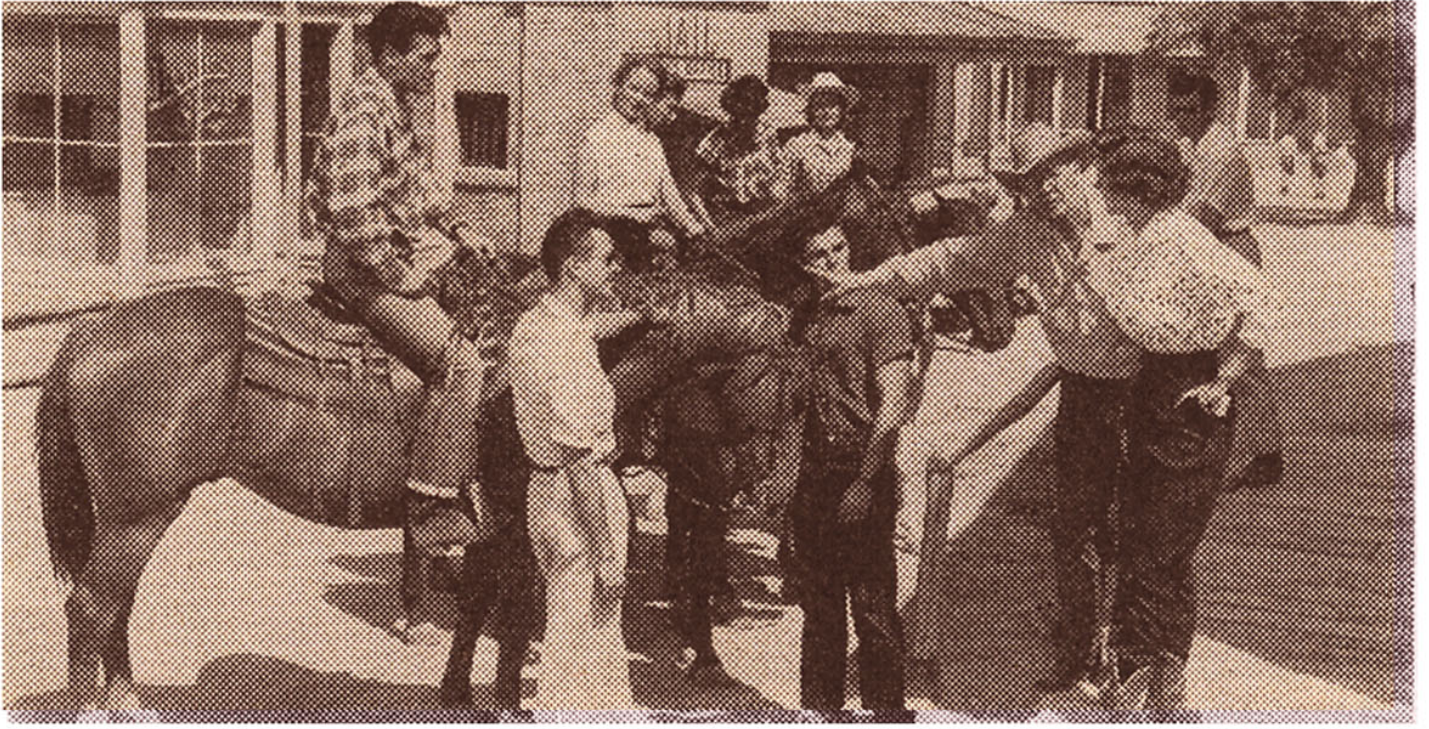
COWBOY SHOWS THE ROPES; ROUGHHOUSE SCENE TICKLES MAMIE