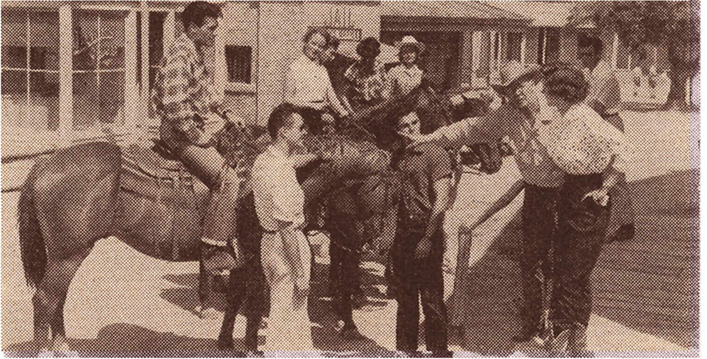
COWBOY SHOWS THE ROPES; ROUGHHOUSE SCENE TICKLES MAMIE