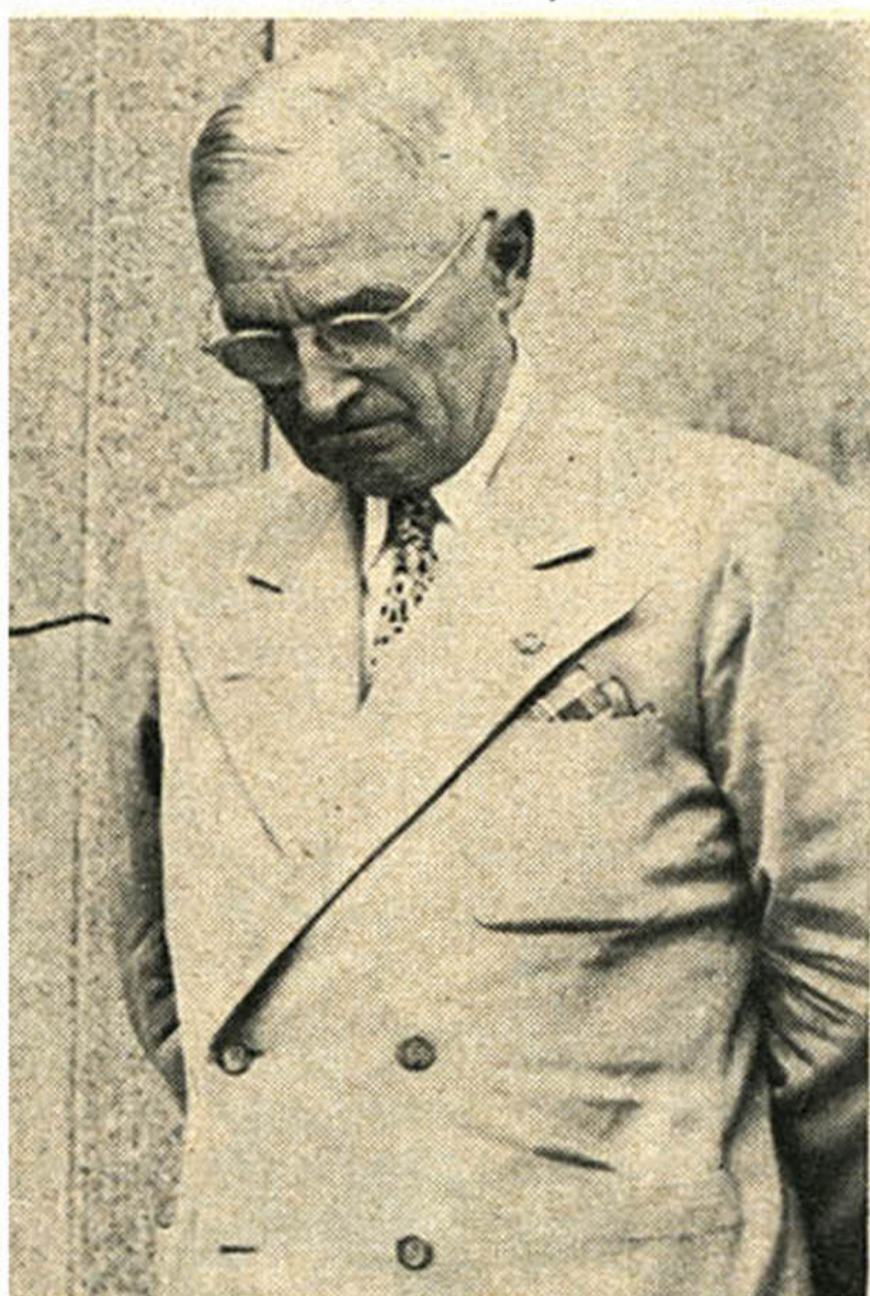
A pensive Pres. Truman: no Munich

The first fateful decision—to send U. S. planes and ships into the Korean fighting—was made with advice of Rep. Walter Judd (R., Minn.). Judd had been sharply critical of U. S. Far Eastern policy on grounds that it was opening the door to Communism. The day after fighting started, State Dept. officials asked Judd's advice on procedures for helping South Korea. He suggested sending air and naval forces on the authority of the U. N. resolution which called the warfare a breach of peace and asked U. N. members for help. Judd proposed backing this up by a new U. N. resolution specifically directing use of force against North Korea. State Dept. men, looking for a method of routing immediate aid without by-passing the U. N., accepted Judd's plan and sold it to Pres. Truman.