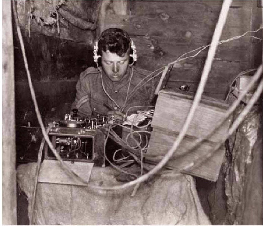
British Listening Post in a Front Line Trench