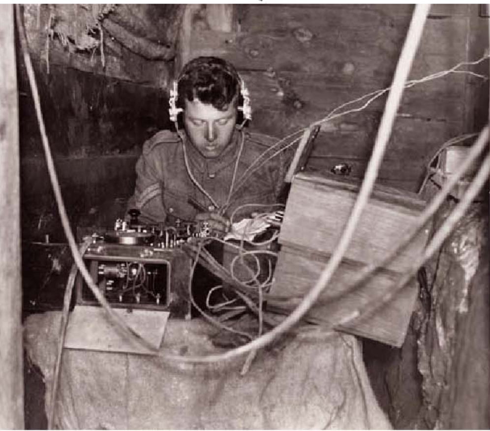
British Listening Post in a Front Line Trench