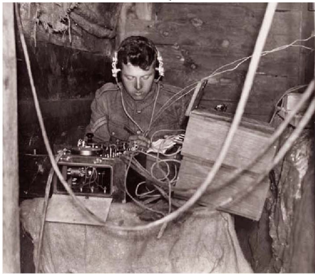
British Listening Post in a Front Line Trench