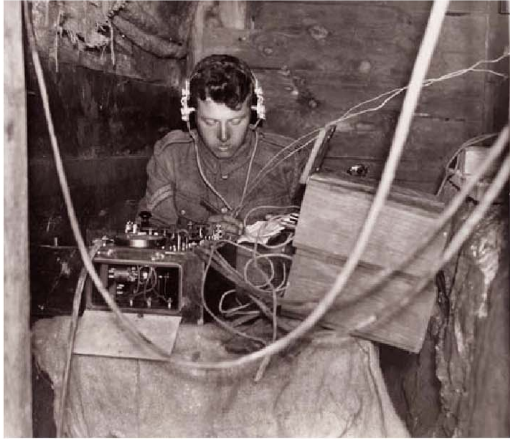
British Listening Post in a Front Line Trench