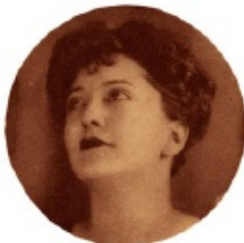
HELEN MORGAN , piano-sitting singer, spent $4,000 at Billingsley's when he needed it most.