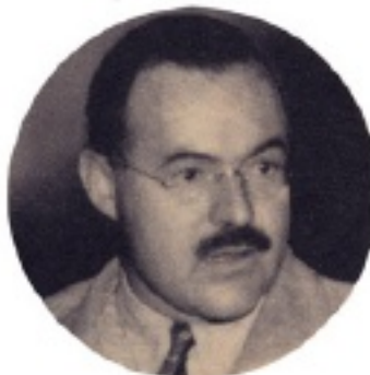
ERNEST HEMINGWAY , celebrated writer of war stories, finds "peace" at the Stork Club.