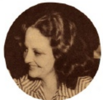
TALLULAH BANKHEAD'S father is Speaker of the House, she the Speaker of the Stork.