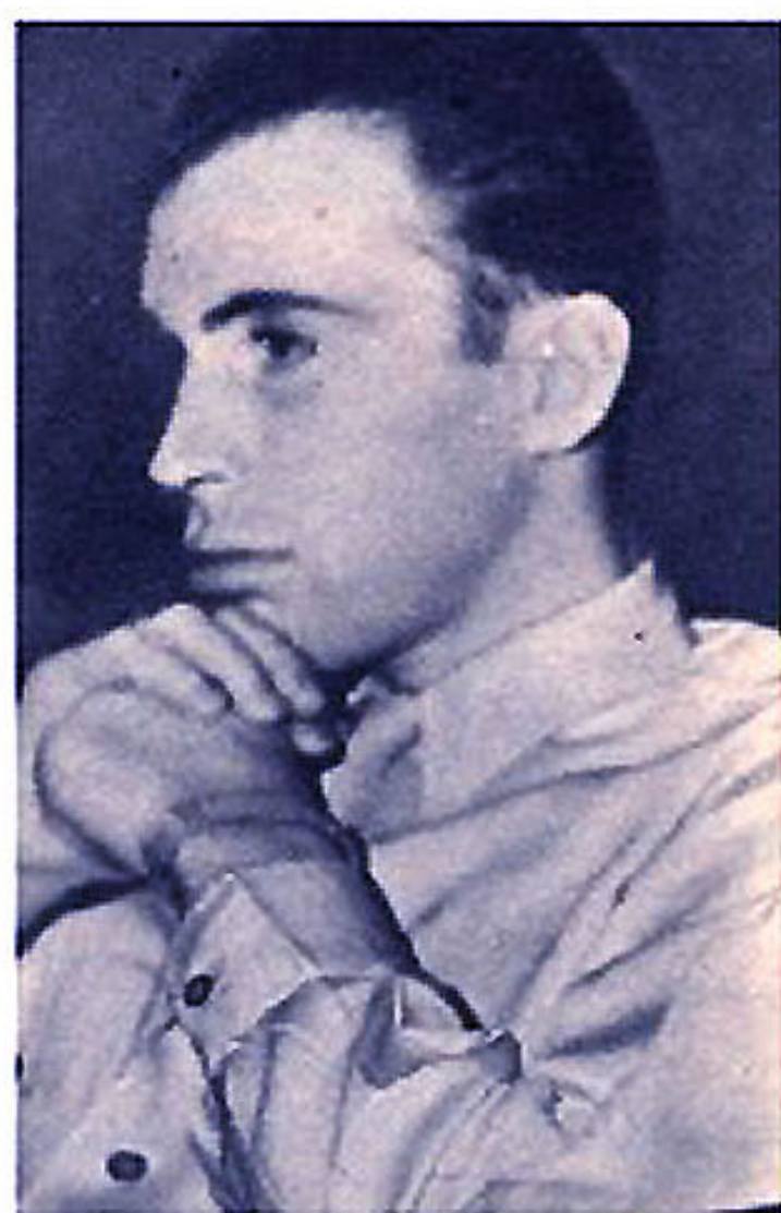
YOUNG GIRL IS TAUT, G. I. JOE HAS TEAR IN CORNER OF EYE SOME MEN HAVE COURAGE OF THEIR EMOTIONS: USE HANDKERCHIEFS