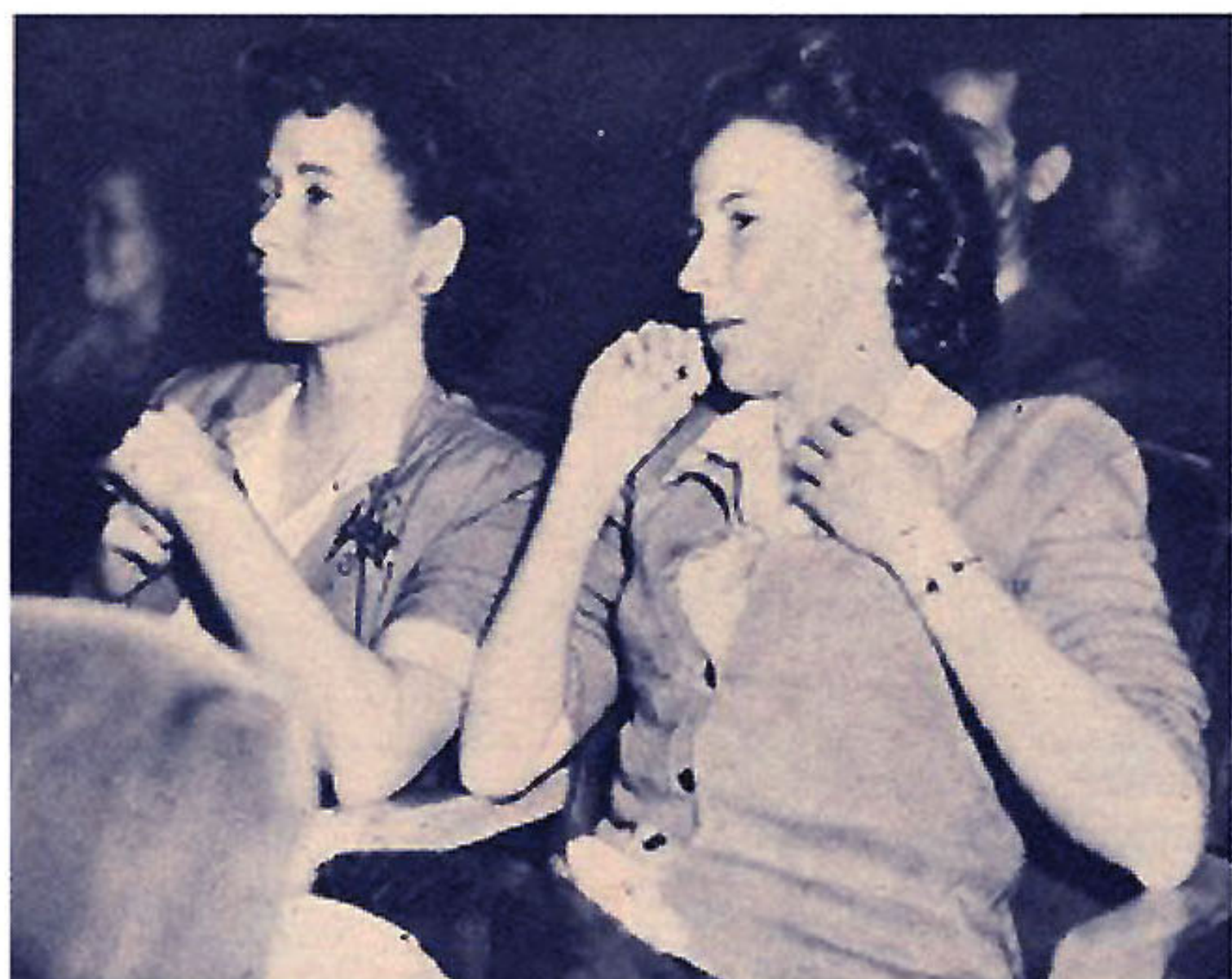
GIRLS' EYES ARE WET DURING A TENDER SCENE IN THE WAR MOVIE

Infrared pictures taken in a theater show how we look when we cry in the movies