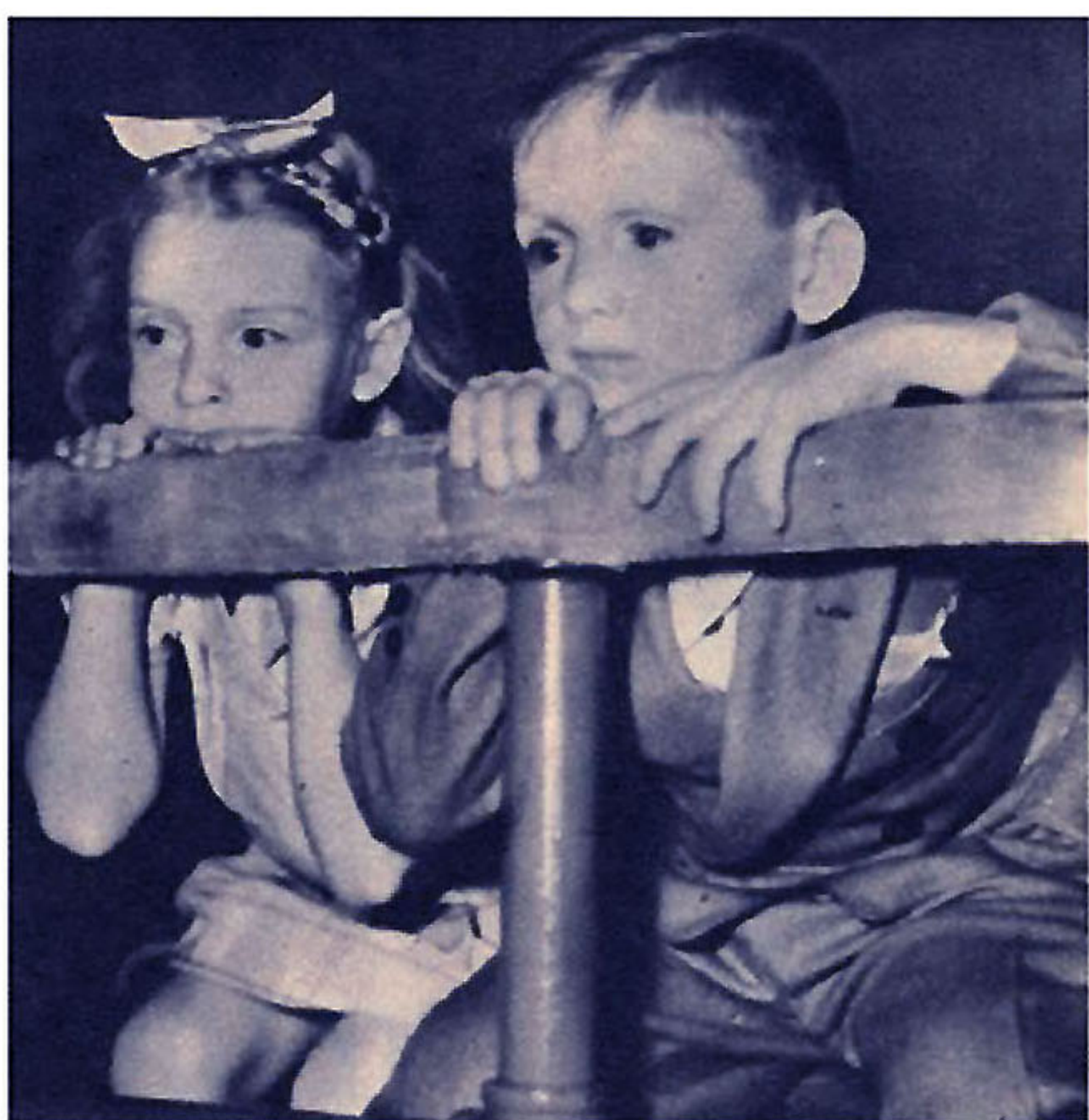
YOUNGER CHILDREN ARE ABSORBED BY THE STORY BUT DON'T CRY