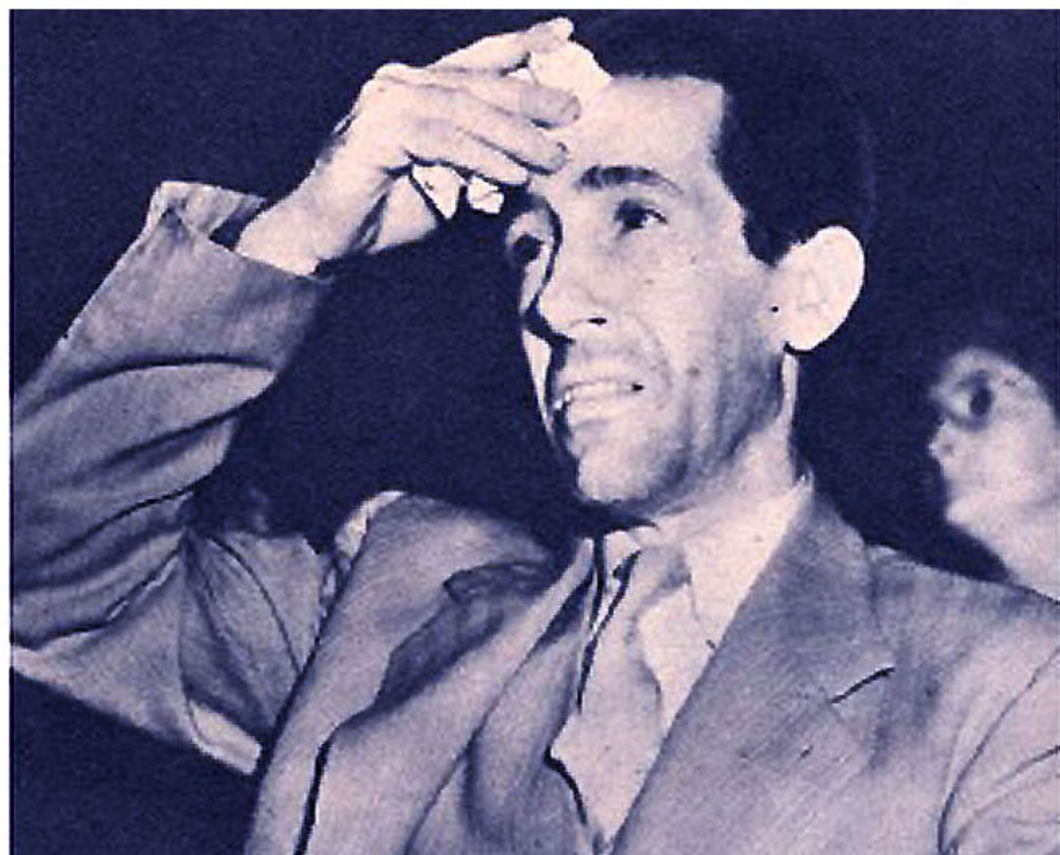
MAN MOPS FOREHEAD DURING ONE OF THE MORE TOUCHING SCENES