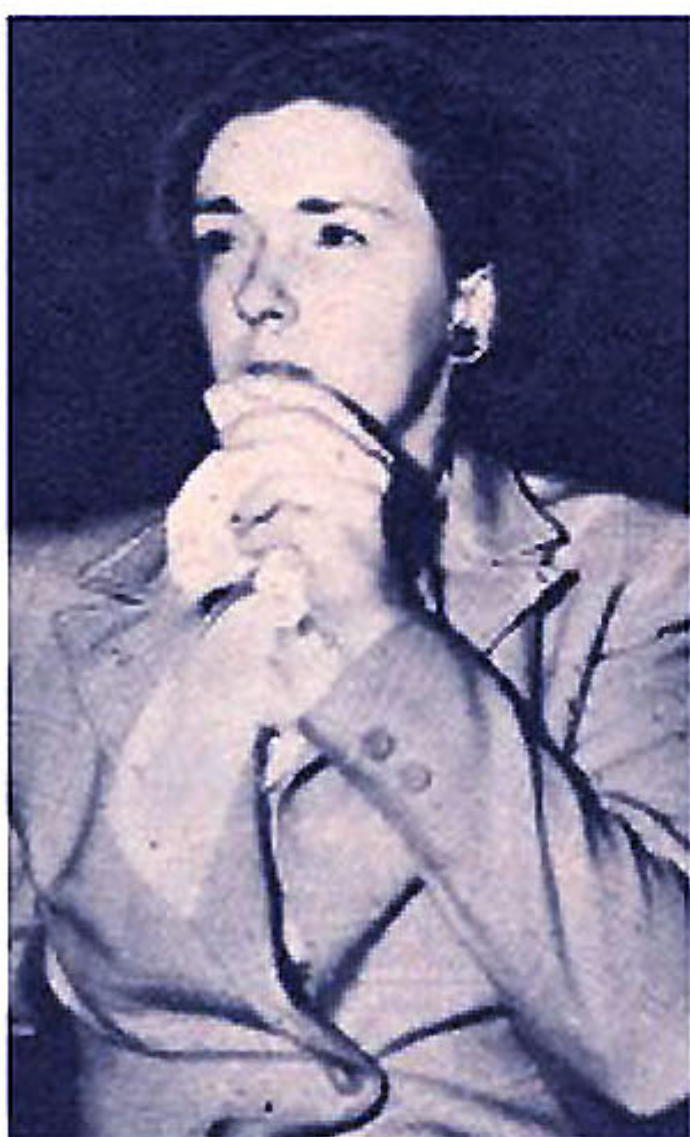
GIRLS OPENLY USE HANDKERCHIEFS DURING PATHETIC SEQUENCE