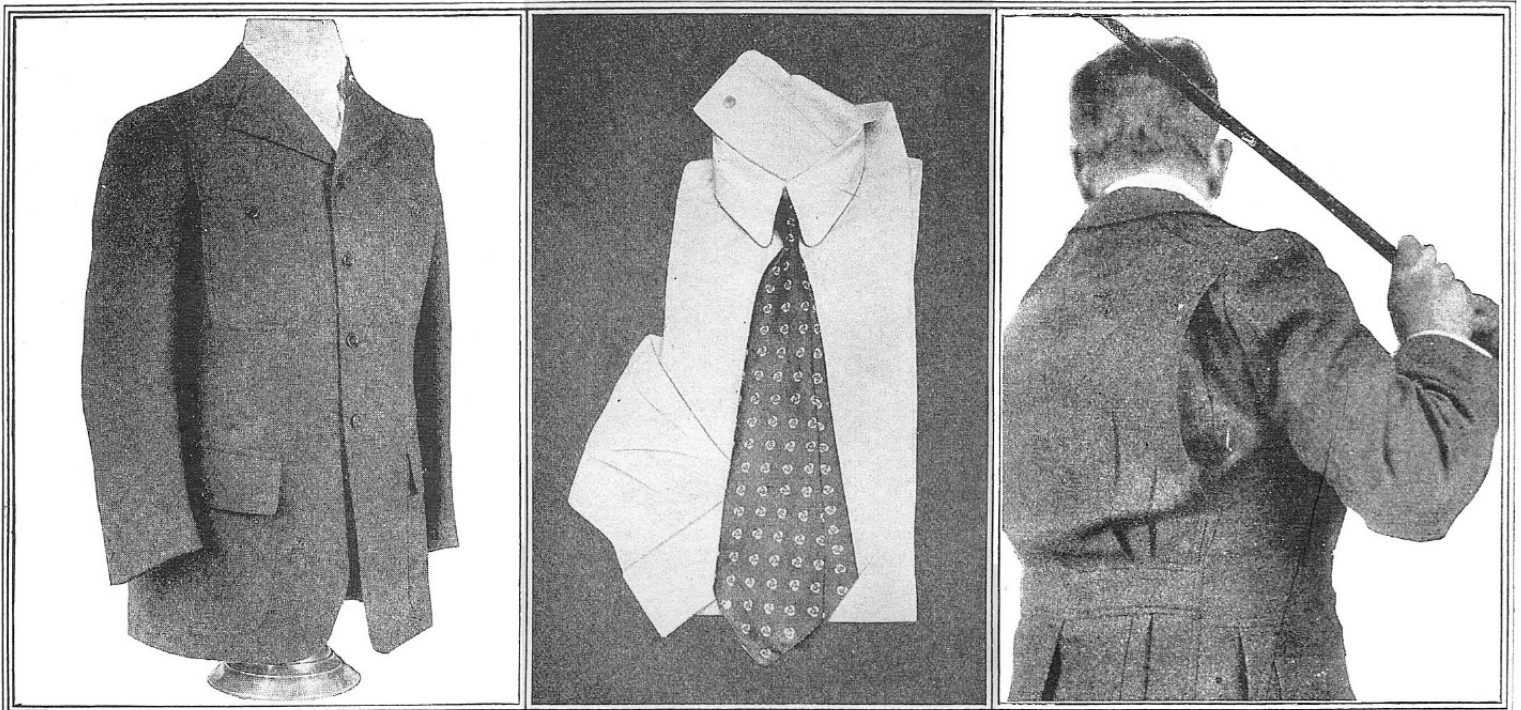
A pivot-sleeve golf coat of which a rear view is shown at the right-hand corner of this page