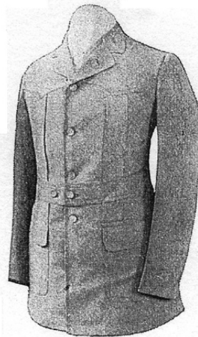
Pivot sleeve golf coat in Ninhai silk. Costs $25. Linen knickers cost $8. Coat and knickers of washable linen may be had for $25