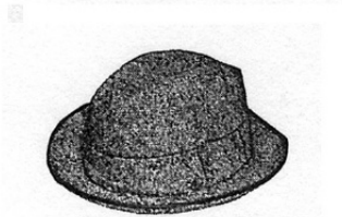
English cheviot knockabout hat, for golf or motoring, $3.50