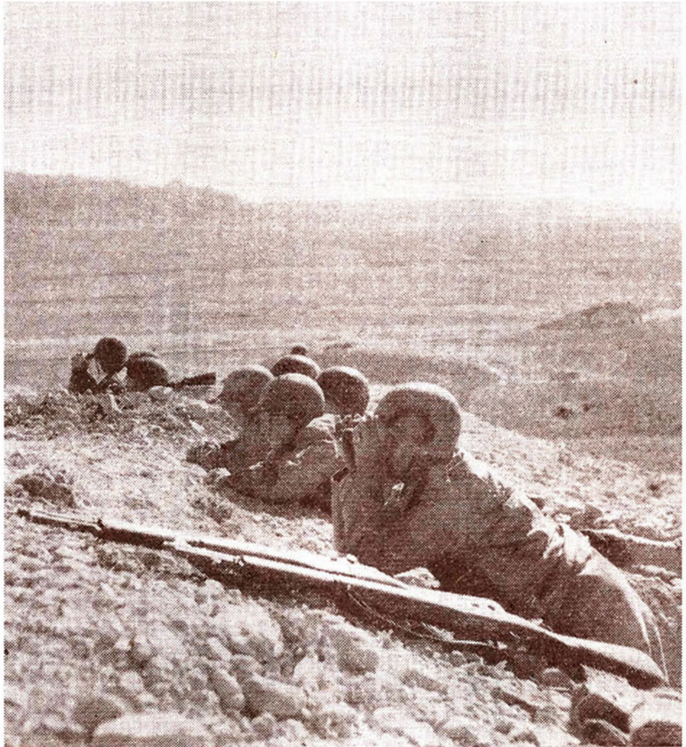
Half a dozen soldiers of an American patrol crouch behind a ridge on the road to Maknassy while their commander scans the desert for sign of the enemy