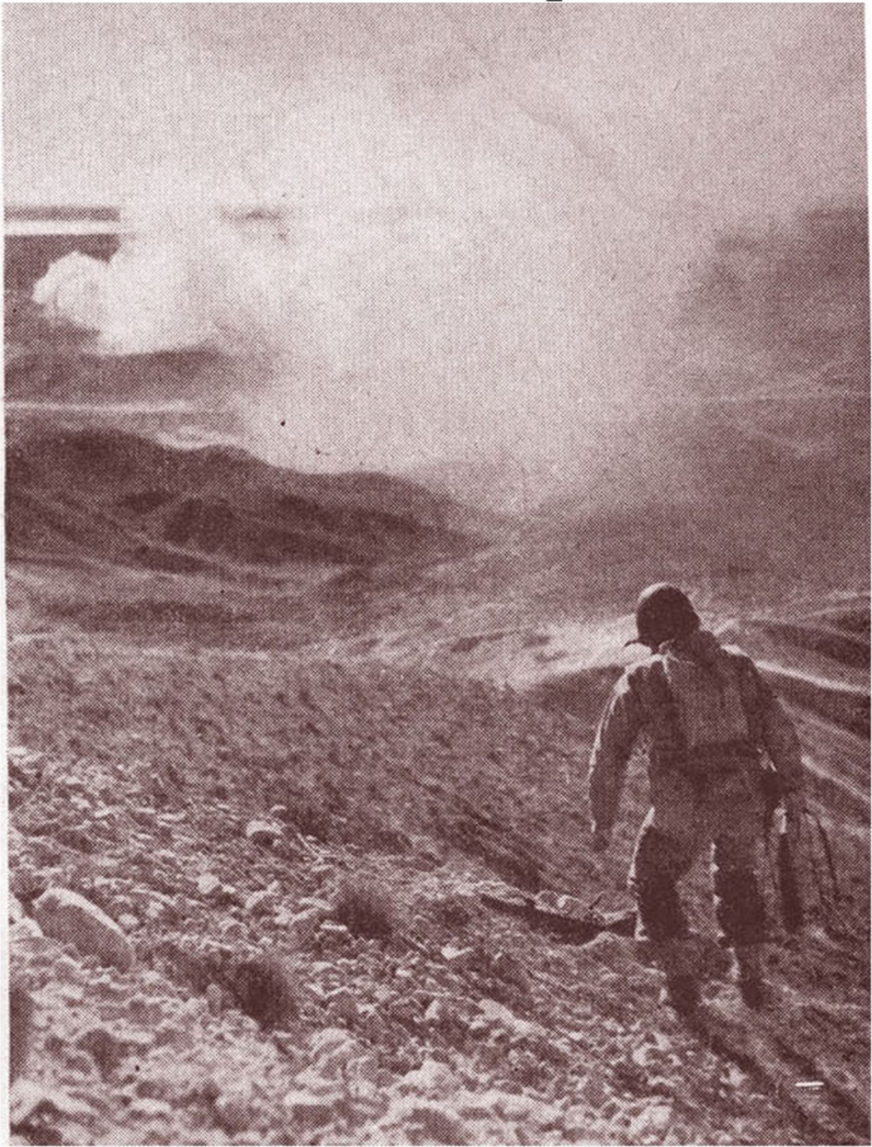
Discovering the screaming death dropped by Stukas, an American soldier moves calmly across the battlefield to his command post