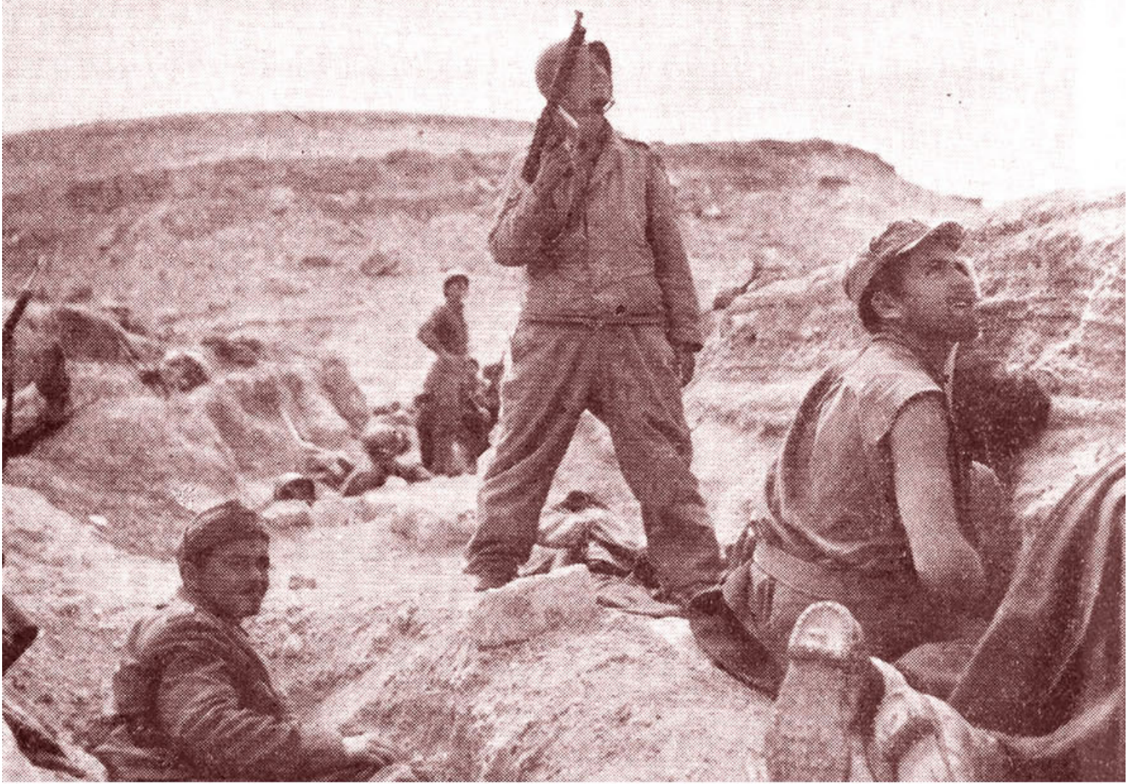
Italian prisoners frequently had to crouch in shallow ravines when their own planes came over. The American soldier with the tommy gun hopes that the plane will fly low enough to give him a fair shot