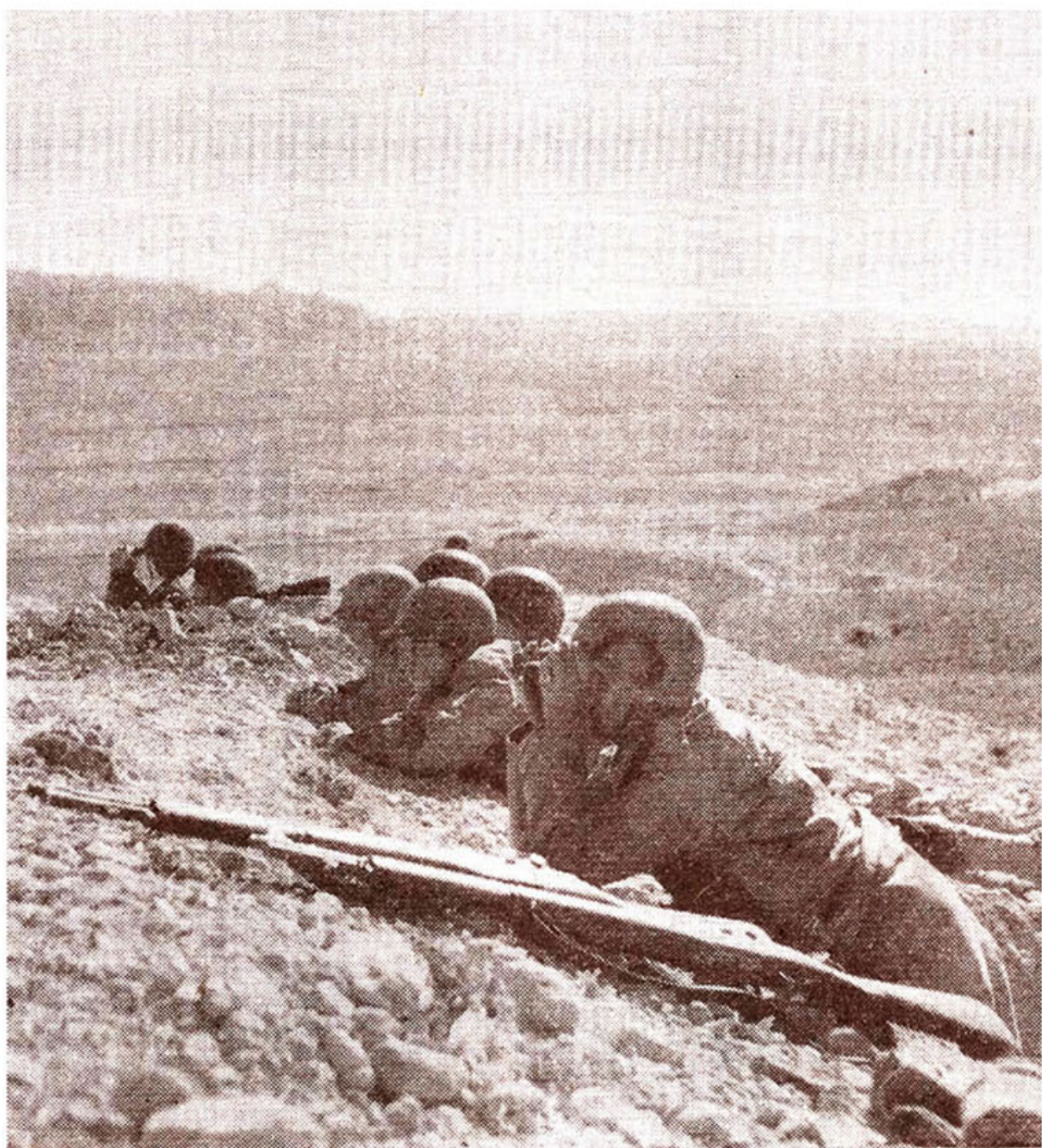
Half a dozen soldiers of an American patrol crouch behind a ridge on the road to Maknassy while their commander scans the desert for sign of the enemy