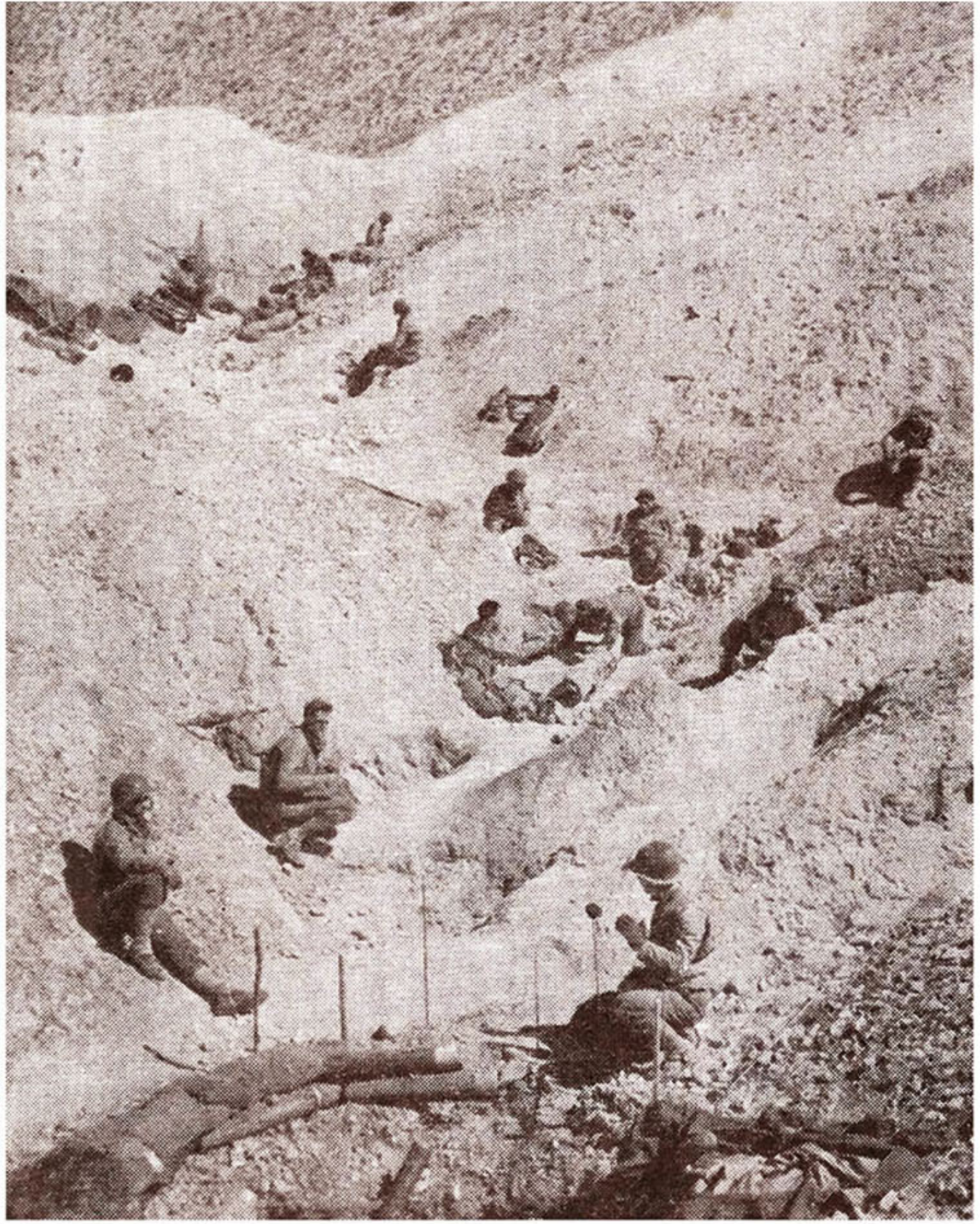
American soldiers here shown find shelter in a ravine from dive bombers and German artillery fire. They are scattered to minimize losses in case of a hit