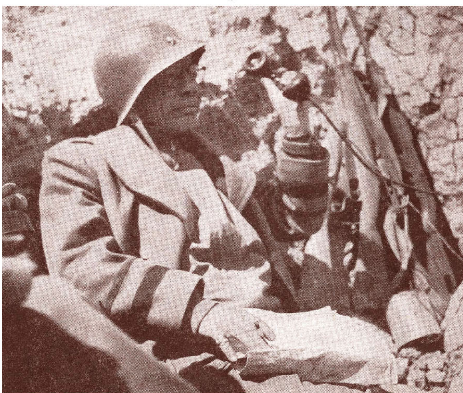
Here is Brigadier General Theodore Roosevelt, who always turns up in the hottest spots, posing for Collier's photographer in an advanced infantry command post

An American gun crew, awaiting orders, kills time with a card game, while one man, with headphones, keeps in touch with the command post. The game they're playing wasn't identified (could be blackjack)