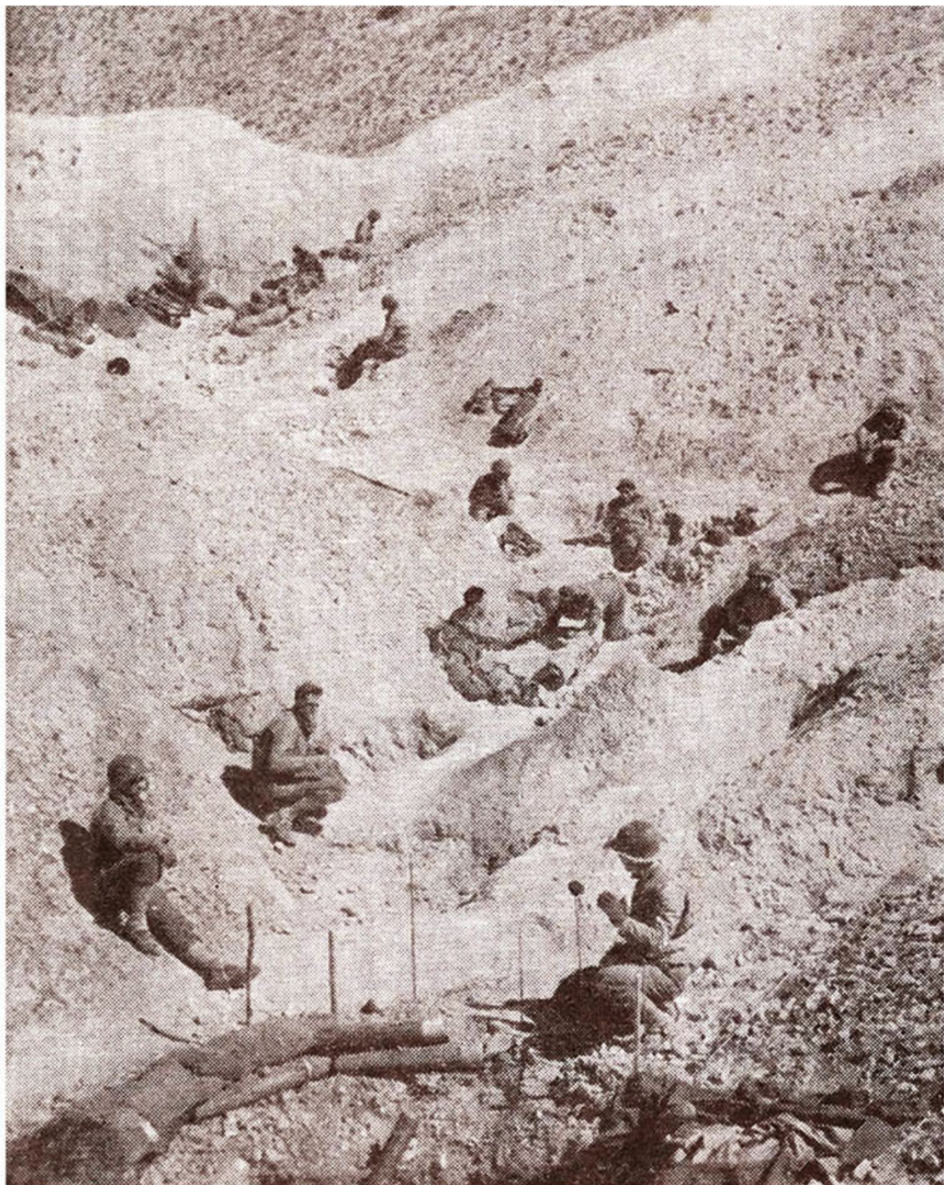
American soldiers here shown find shelter in a ravine from dive bombers and German artillery fire. They are scattered to minimize losses in case of a hit