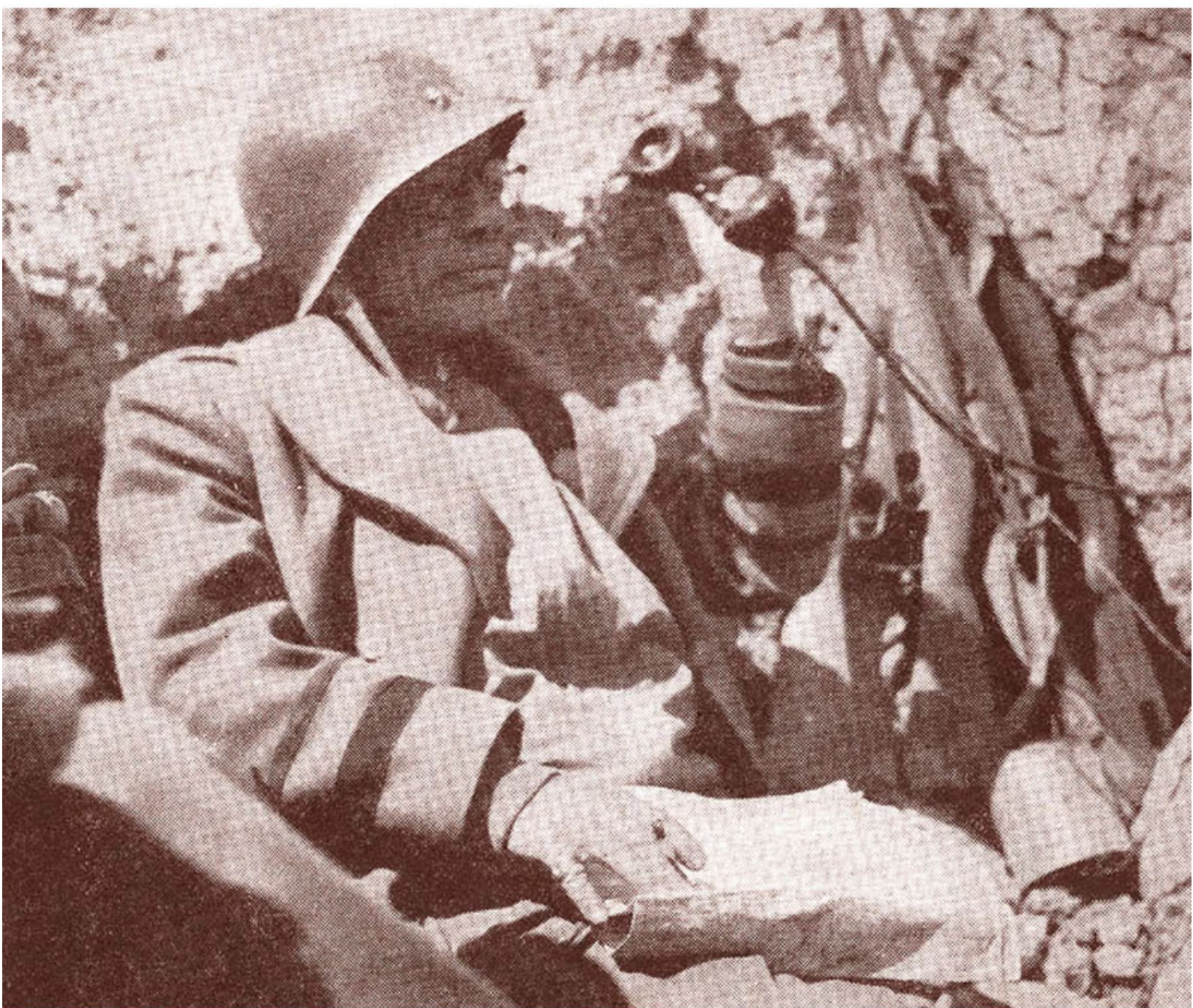
Here is Brigadier General Theodore Roosevelt, who always turns up in the hottest spots, posing for Collier's photographer in an advanced infantry command post

An American gun crew, awaiting orders, kills time with a card game, while one man, with headphones, keeps in touch with the command post. The game they're playing wasn't identified (could be blackjack)