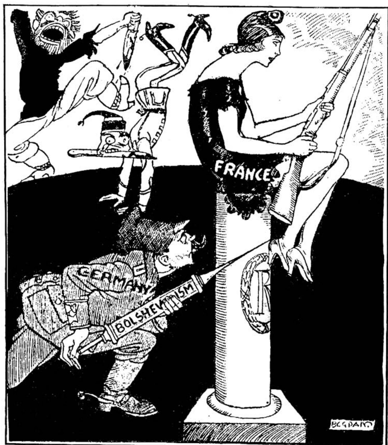
THE POISONED NEEDLE.

GERMAN FRITZ—"While France is so intent on execution of the Peace Treaty, I'll inject this serum supplied by the firm of Lenine, Protzky & Co."