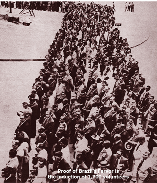
Proof of Brazil's Fervor is the induction of 1,700 volunteers