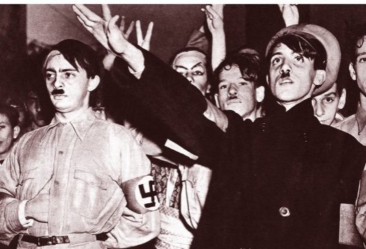
BRAZILIANS LOVE TO RIDICULE THE TRICK HITLER MOUSTACHES, THE SWASTIKAS, AND BIG-WIG POMPOSITY OF THE HITLER-MUSSOLINI-HIROHITO CLUB

14,000,000 Hitler-hating Brazilians are on our side