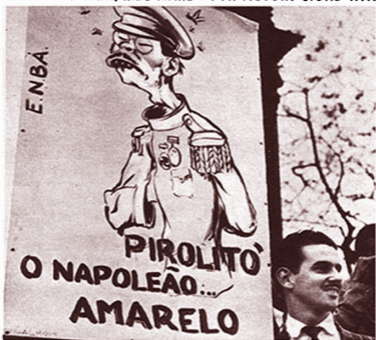
"COCKY BRAGGART TRIES TO BE A YELLOW NAPOLEON"