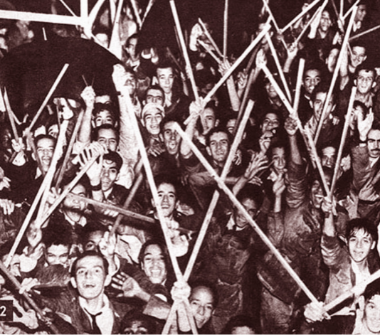
DESPITE DRENCHING RAIN, KIDS MAKE V-FOR-VICTORY SIGNS WITH BATONS