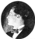
BARON DE MEYER