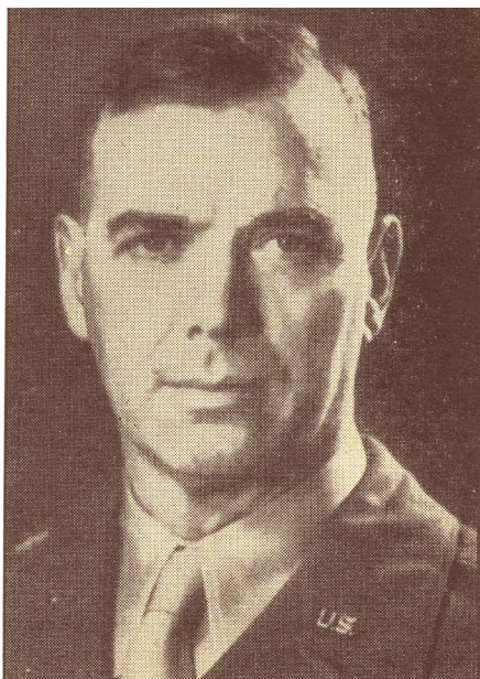
Van Fleet. He replaces Ridgway as head of U.S. forces in Korea

"General MacArthur's place in history as one of our greatest com-