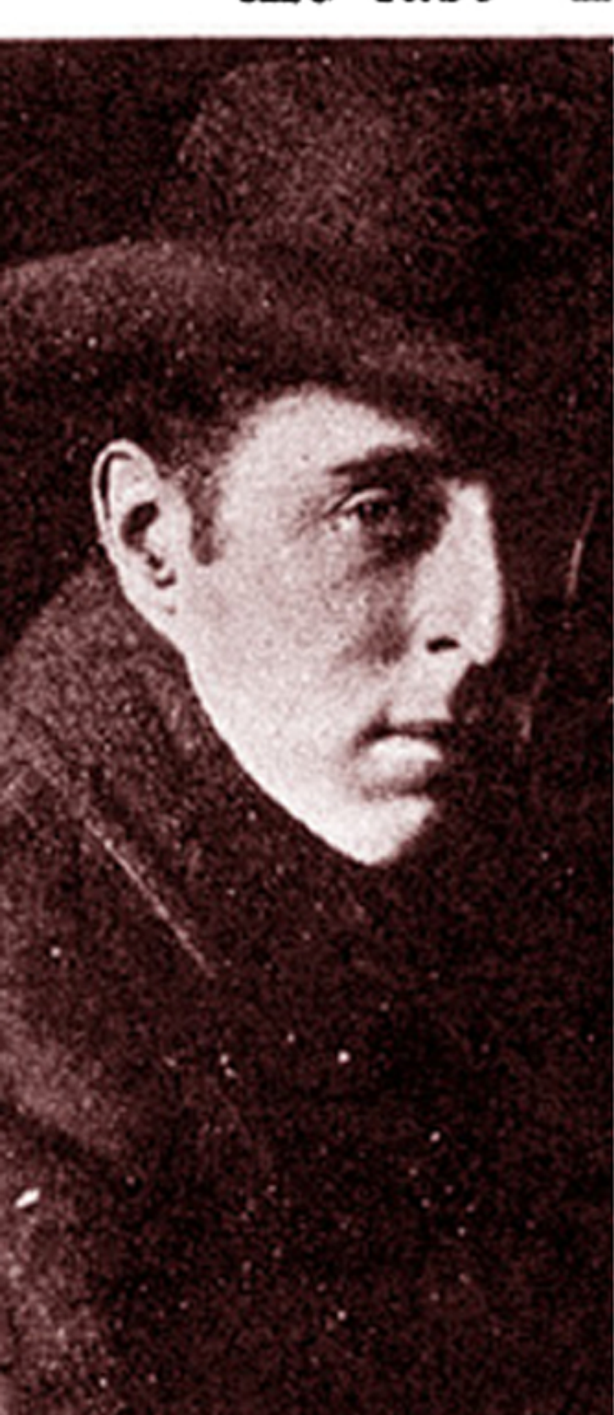
D. W. GRIFFITH the $100,000 Director

MARCUS LOEW —whom we have left to the last—has had a spectacular career.