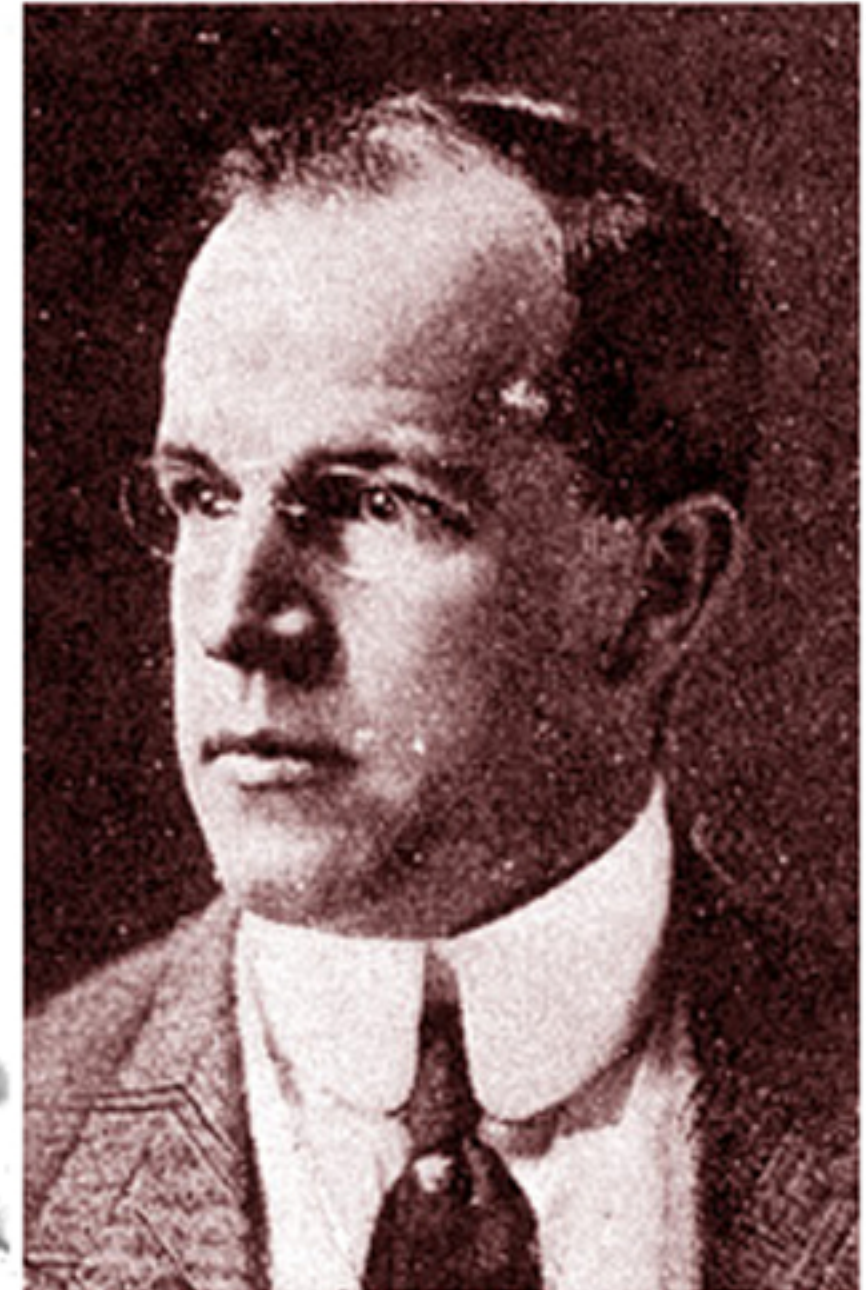
J. STUART BLACKTON of the Vitagraph Company