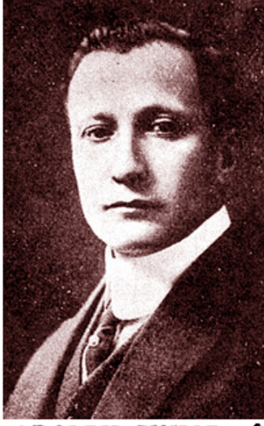
ADOLPH ZUKOR of "The Famous Players"