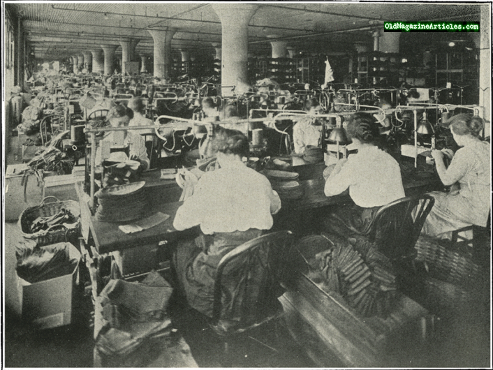
SEWING OVERSEAS CAPS IN A ST. PAUL, MINN., FACTORY.