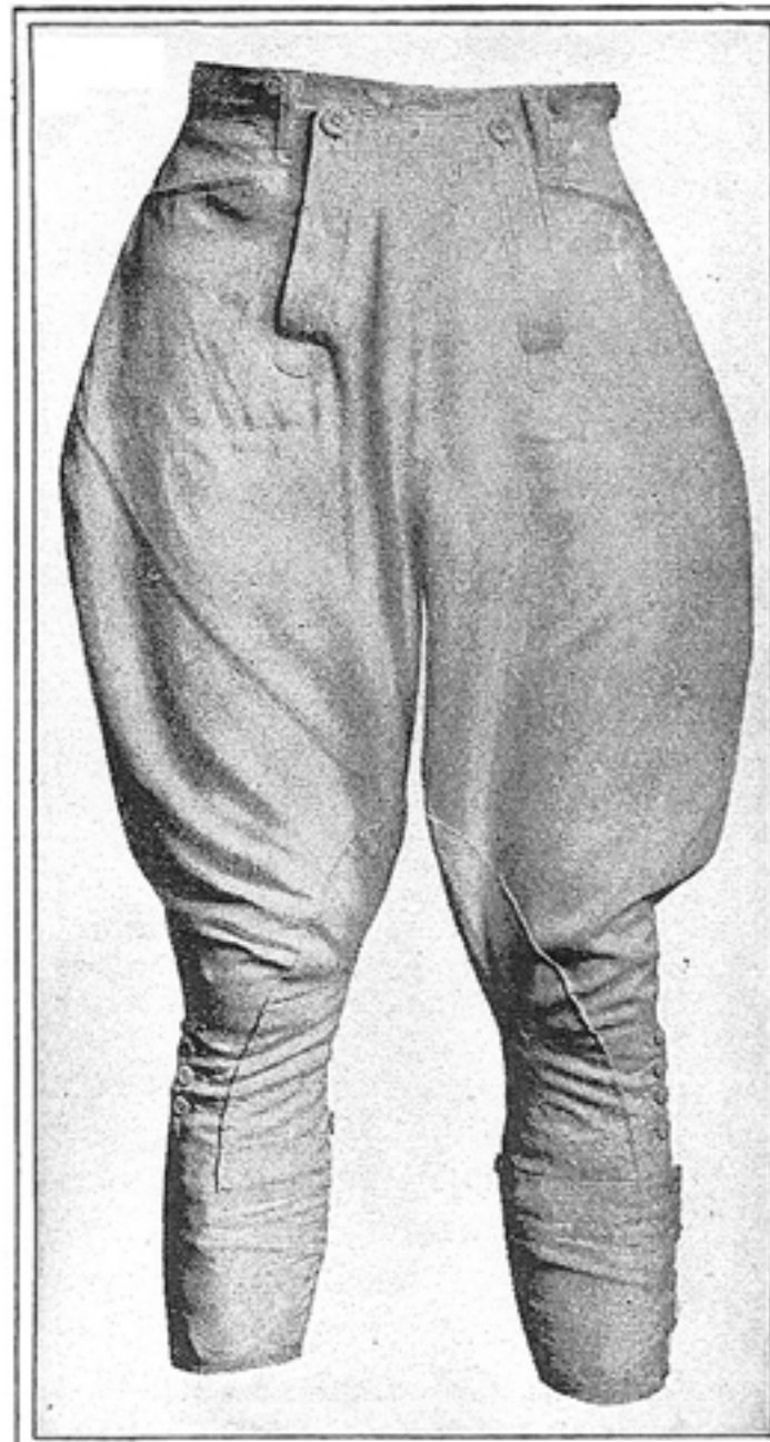
These gabardine riding trousers are light, cool, and may be readily cleaned, $16