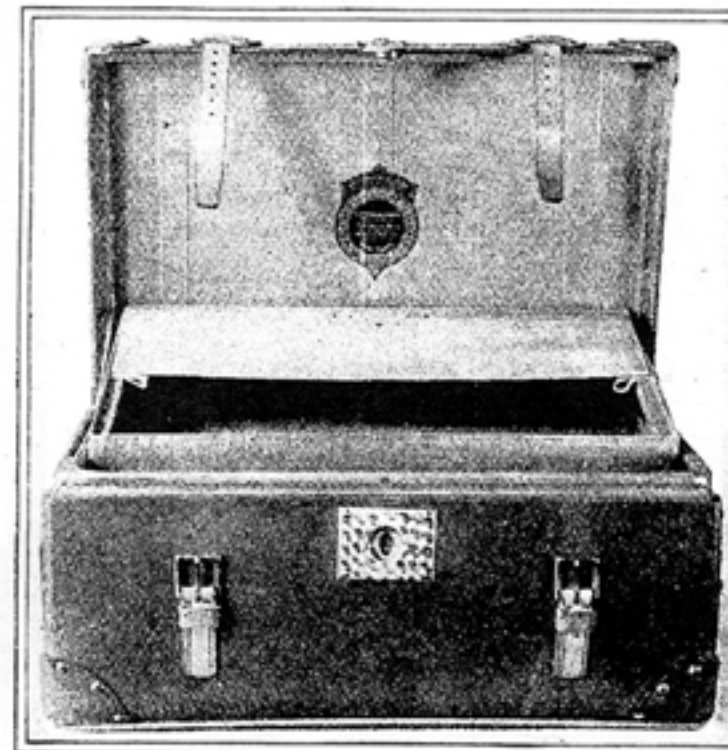
Leather trunk of convenient size, cloth lined, $44