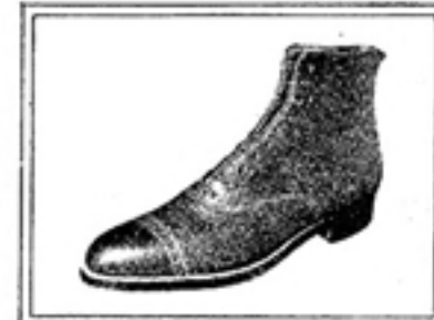
The shoe at the top is an English grain walking boot, $10. The riding boot is Russia calf, $22

Often I have wondered why some person, whose business it was to wonder about such things, didn't invent a pair