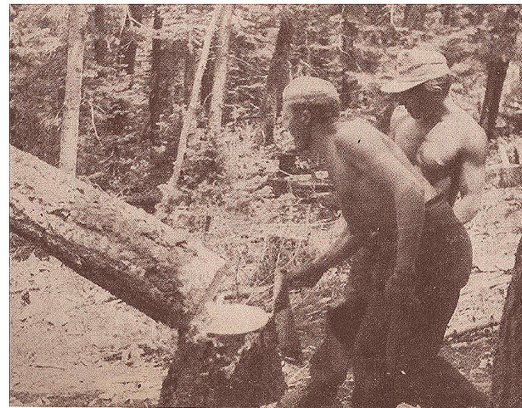
INTERNATIONAL RED CROSS

U.S. soldiers give full military honor at the funeral of a Nazi prisoner. Several captives have died, some killed themselves, a few were "purged" by Nazis