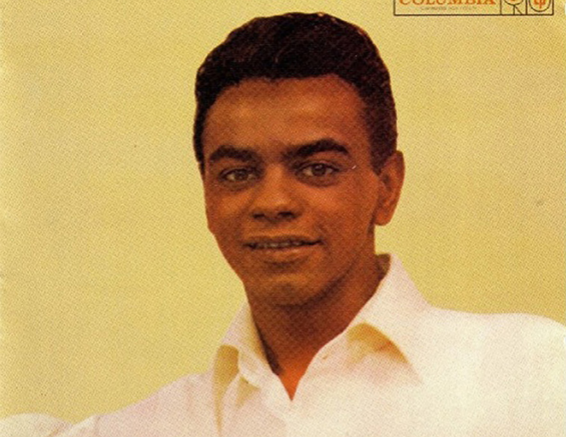
The first album (1956)