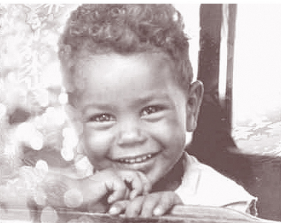
Singer as toddler