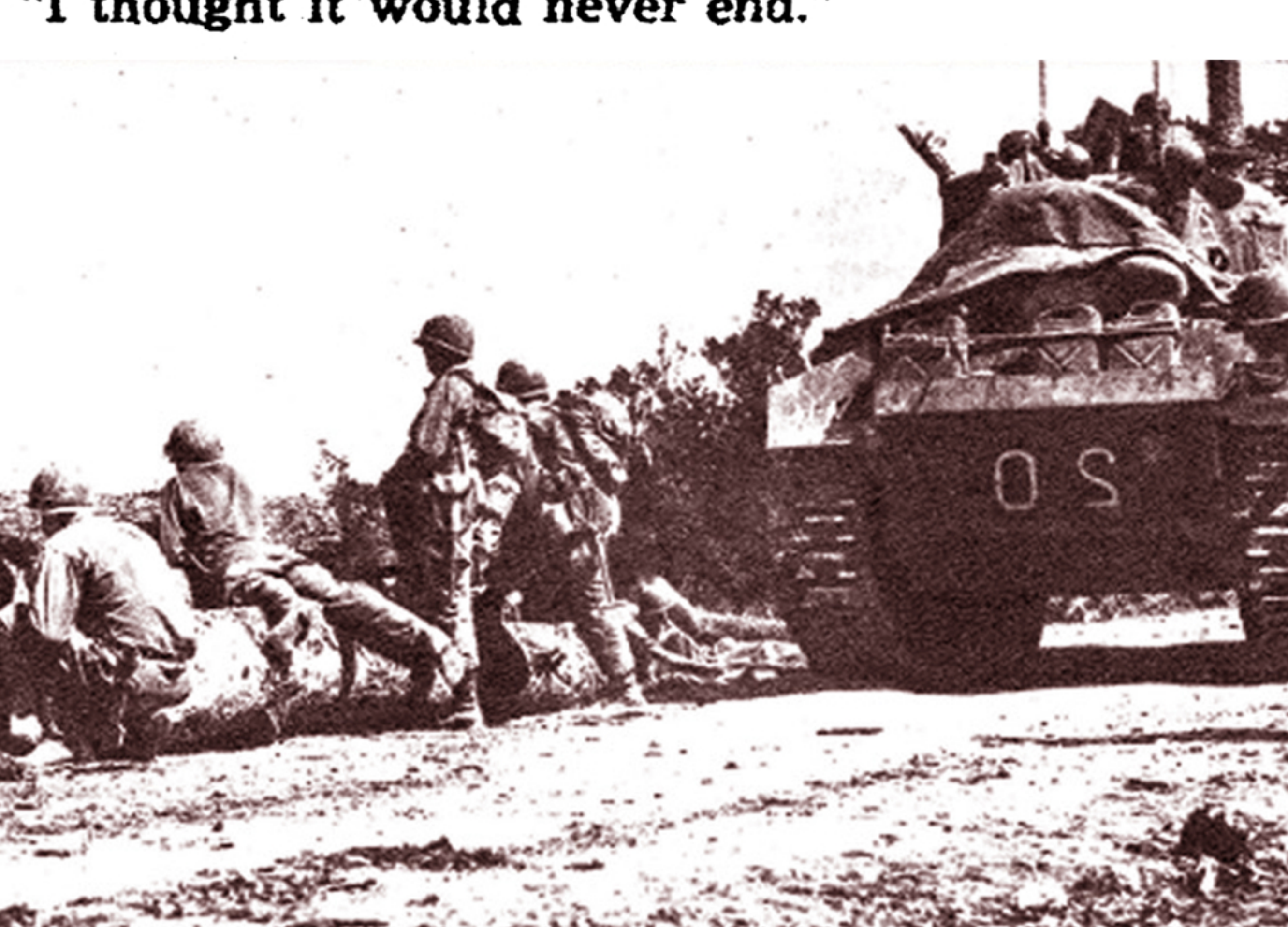
As the infantry fought ahead on Okinawa, Jap machine-gun and sniper fire kept pinning them down. Here GIs are held up as a sniper works on them.

Down on the beach the amtank men counted bodies in the shallows, scattered along the base of the seawall. Pvt. Sullivan had guessed right; some of them did have sabers. Damp wood sputtered and smoked. The marines were going to have bacon and coffee for breakfast. In the air there was suddenly a high, thick noise. It changed to a piercing whistle, ended in a tremendous crash a short distance down the beach. Before the men could make up their minds whether the shell was a freak more began to land around them. There was no doubt about it. Some Jap over in Naha had spotted them and was zeroing in. Lt. Robertson decided that this was too much. "Get your engines started," he shouted, "we're pulling out." The marines with their mess kits full of sizzling bacon hurdled the seawall and piled aboard. Engines roaring, five amtanks crunched painfully out across the reef in single file. If they could make deep water they would be fairly safe. Shells burst just behind the last one, throwing up geysers of mud and water. The crew ducked and thought about what perfect targets they must be making—"Like the line of beginners' targets in a shooting gallery," someone decided. The last tank bumped down in deep water. The Japs gave up. Platoon Sgt. John Spelce of Clearwater, Fla., looked back over his shoulders and shook his head. "What a helluva night that was," he said. "I thought it would never end."