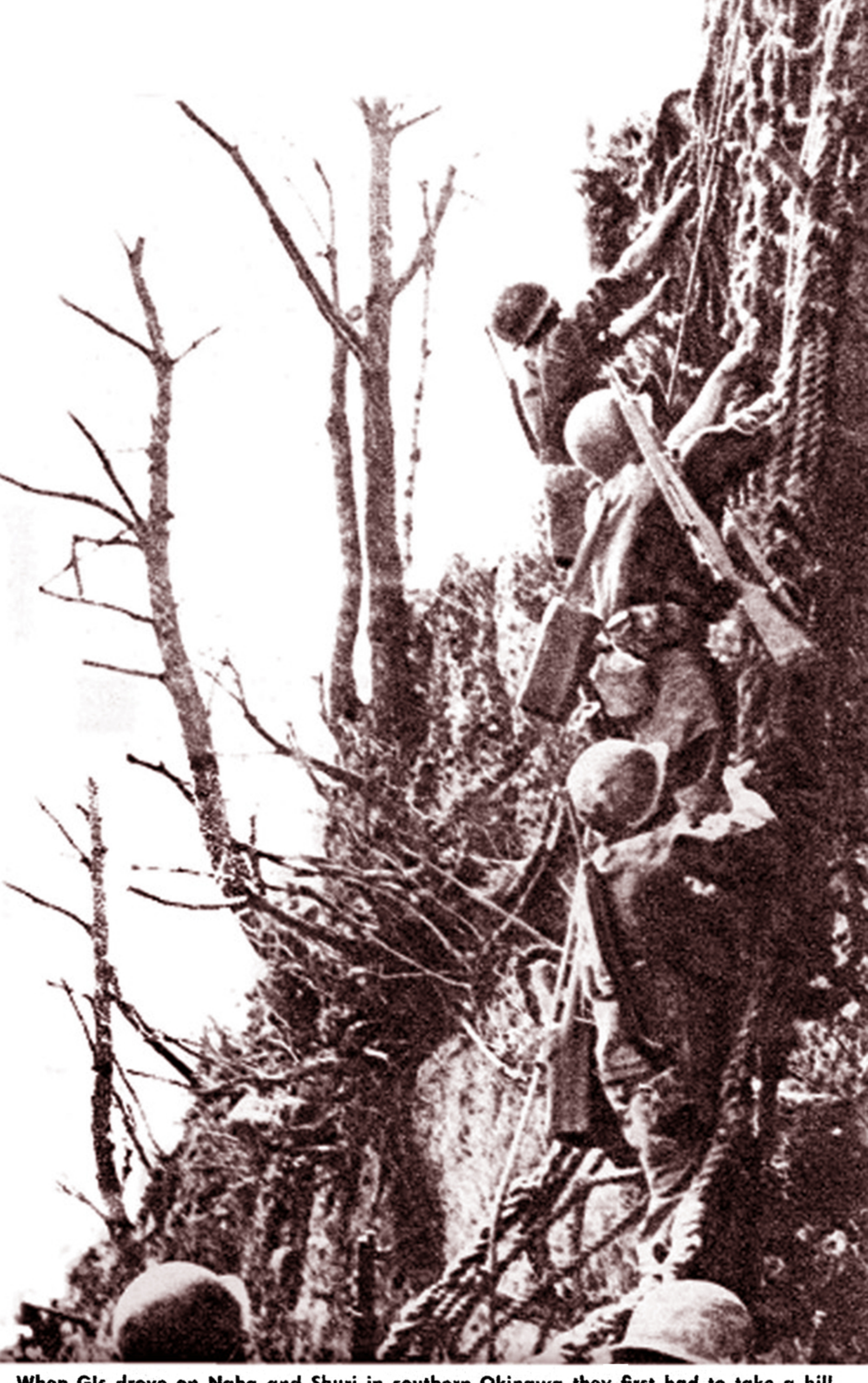
When GIs drove on Naha and Shuri in southern Okinawa they first had to take a hill known as the "Escarpment," a network of caves and pillboxes covering the approaches to the two cities. Here men of a combat-engineer outfit carry satchel charges up the "Escarpment" to blow out Jap cave entrances. They use ships' cargo nets to scale it.