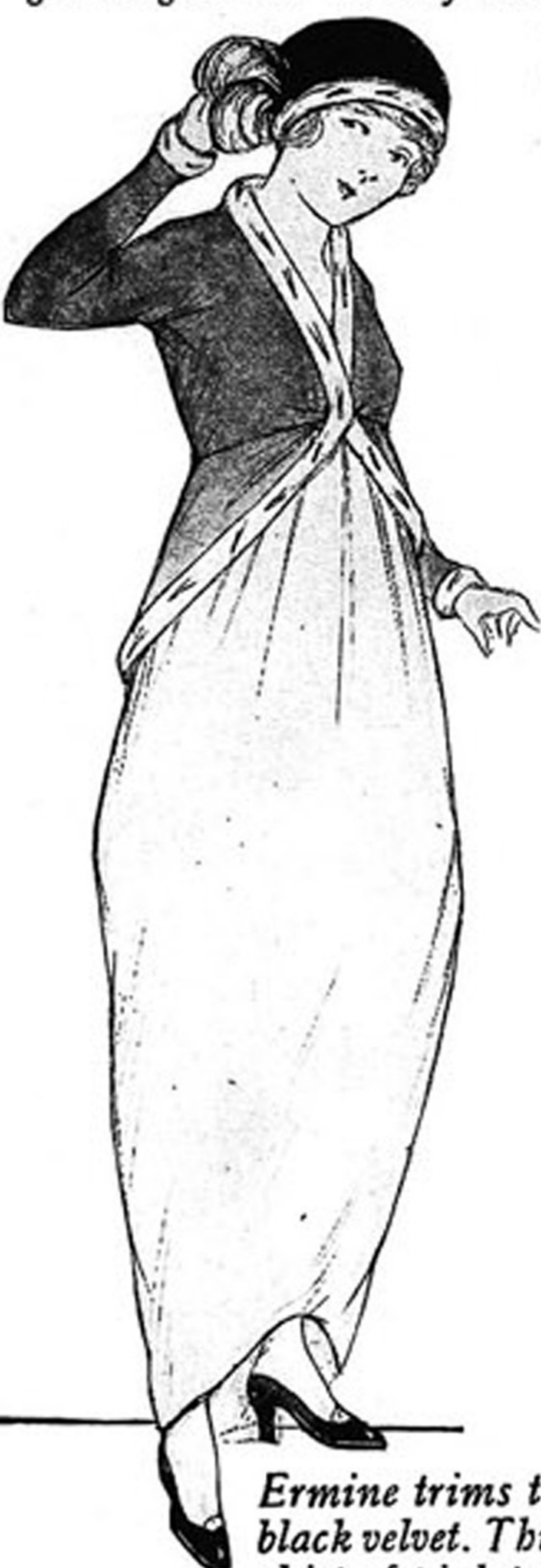
Ermine trims this short peasant's coat of black velvet. This tops a full-hipped, bagged skirt of pink taffeta which has the foot of skirt upcurved in front. Made by Grouet