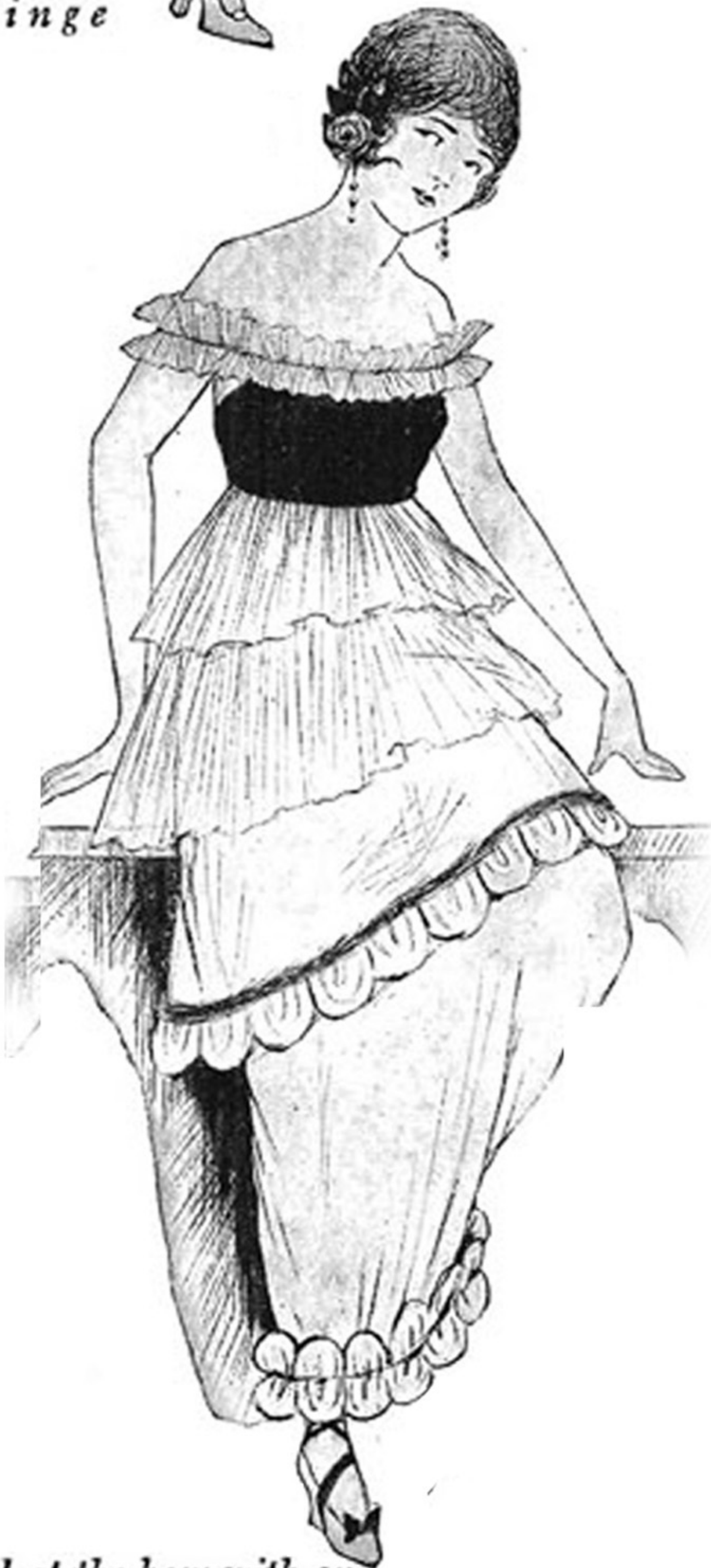
Pink taffeta, trimmed at the hem with an old-fashioned scalloped ruche is used for this charming evening frock. The tunic is edged with a band of skunk, over which is a ballet dancer's white tulle second skirt. The bodice is sweetly old-fashioned with its Second Empire frill across the bust and the deep black velvet waistband. The shoulders are quite bare