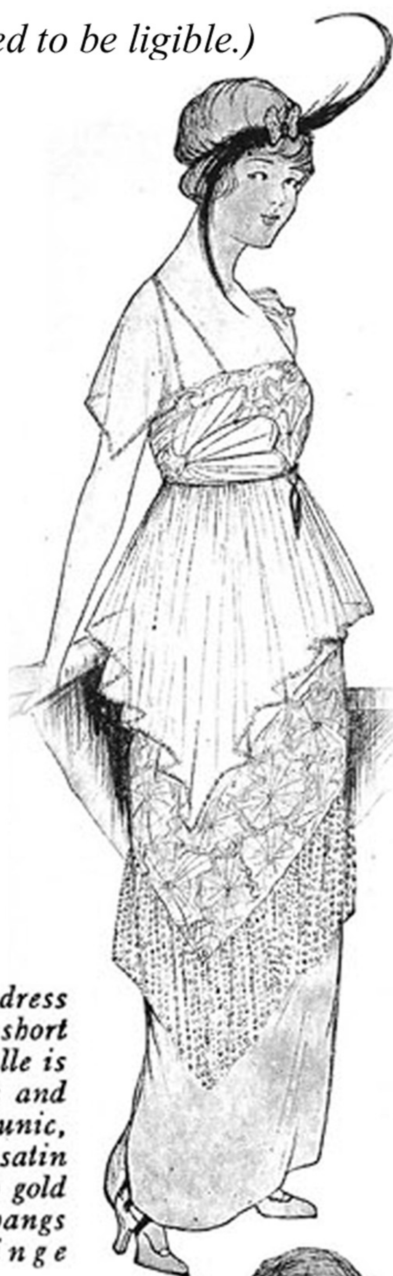
An elaborate evening dress of white satin. The short over-tunic of white tulle is edged with rhinestones and overhangs a deeper tunic, bordered with green satin which is covered with gold lace. From this hangs a deep crystal fringe

(Sorry, the rest of the article was too damaged to be legible.)