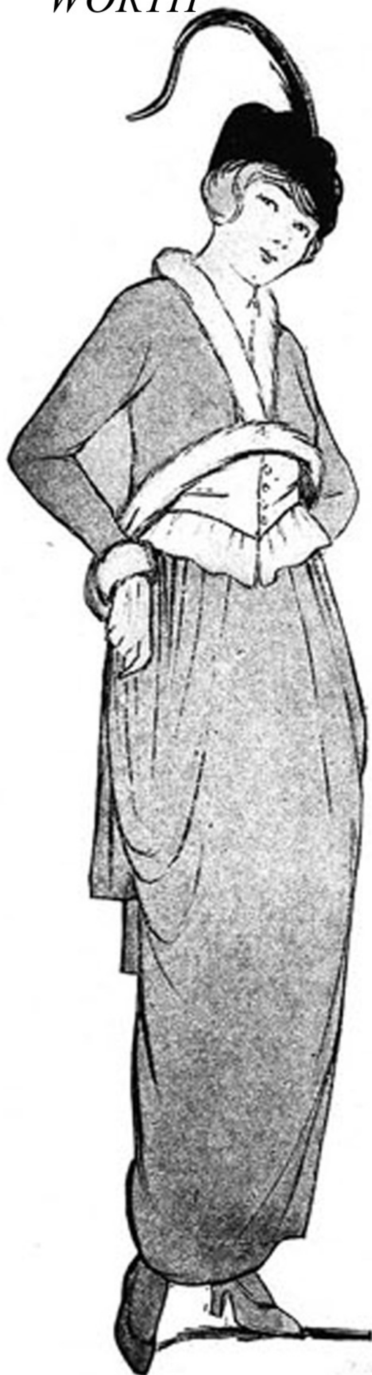
An excellent color combination is this green velours de laine afternoon tailor-made with its squirrel trimmed bolero worn over a buff satin waistcoat