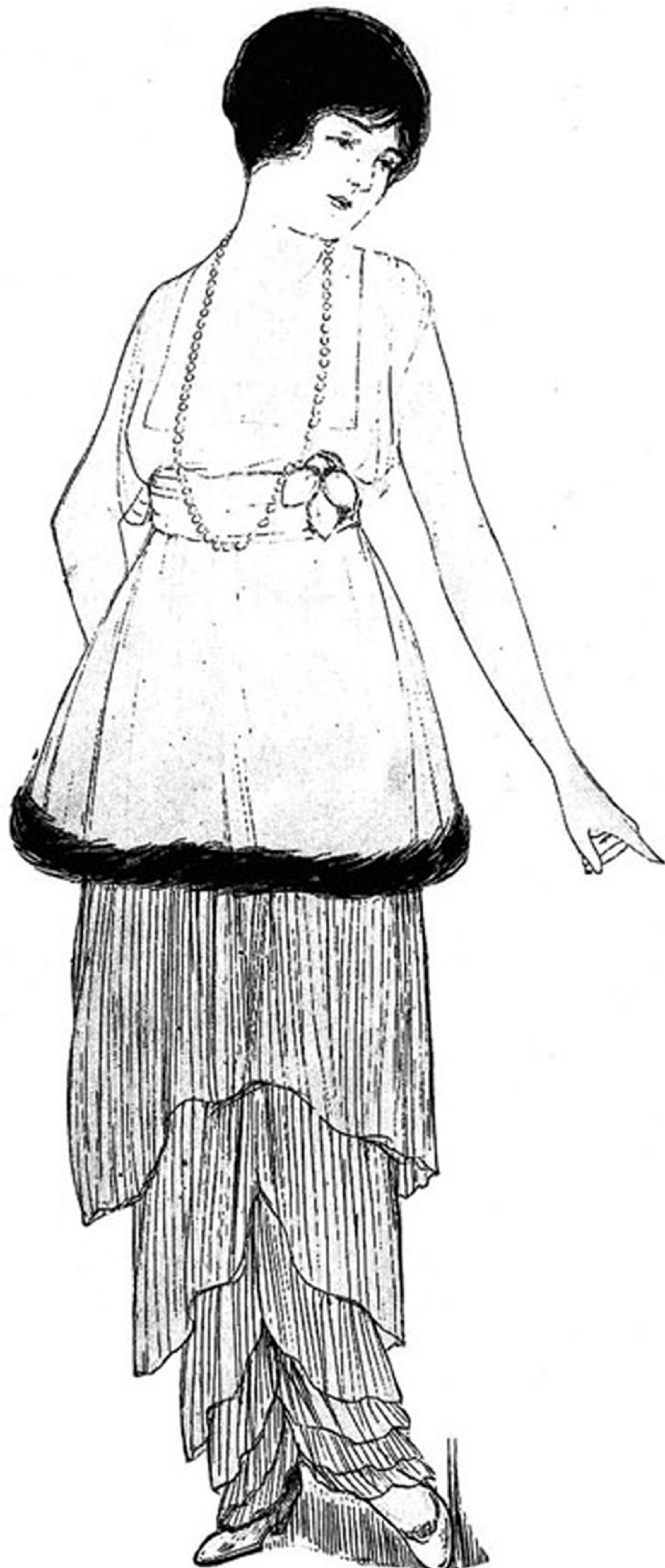
A dance frock of gauze and lace. This favored new skirt has skirt over skirt of pleated gauze topped by a fur edged tunic. Ripe velvet fruits at the girdle give the note of color