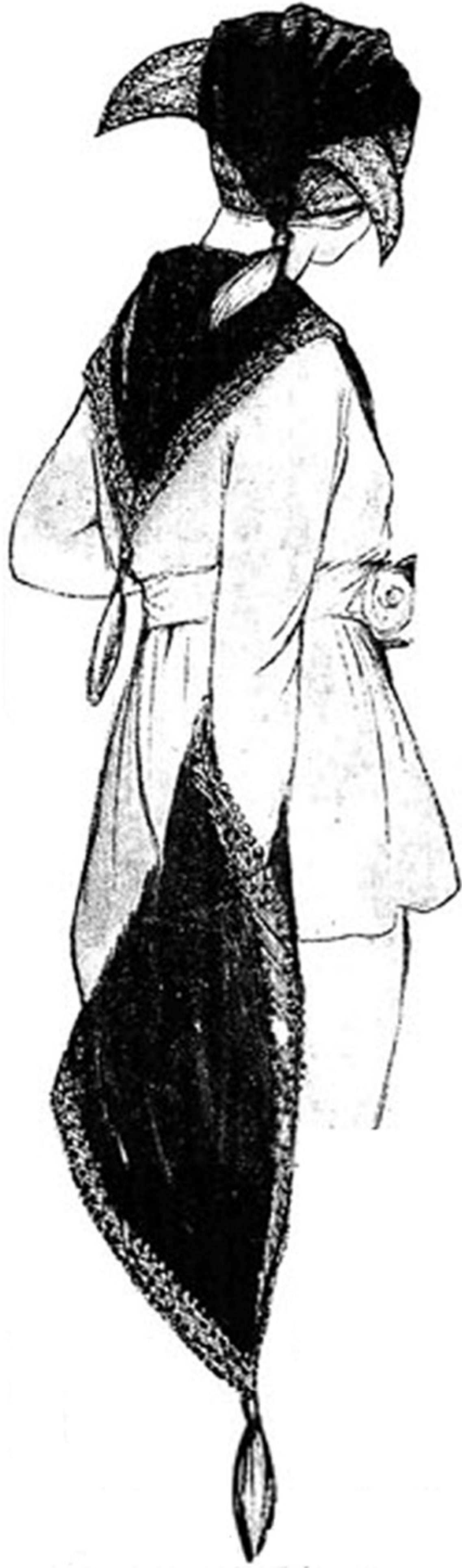
Carlier fashions this "set"—one of the season's successes—of black panne velvet edged with jet and tasseled with steel.

Over and over again Poiret uses black and white in various combinations in his latest creations. One dress in black and white shows a black satin foundation