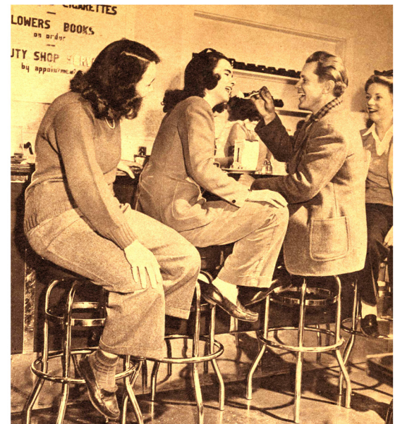
Favorite afternoon hangout for these Englewood girls is the swank Hospitality Shop where there's no regulation against slacks. If there were, they'd AS THEY DO IN HOLLYWOOD, ENGLEWOOD GIRLS WEAR SLACKS AT NIGHT, HERE RELAX HAPPILY AT THE NEARBY TEANECK THEATRE