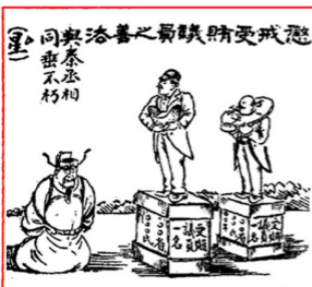
A SHANGHAI VIEW.