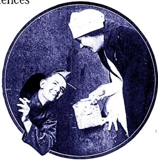
Home again and a Red Cross welcome.

Yanks Return from Chaotic Russia Fed Up with Service & Seek New Words to Describe Their Unusual Experiences