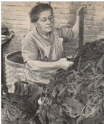
Stockings must be sorted and all cotton tops removed before the remaining silk can be processed.