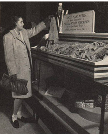
Stores are collecting old silk hose for conversion into powder bags for use in our big coast defense guns.