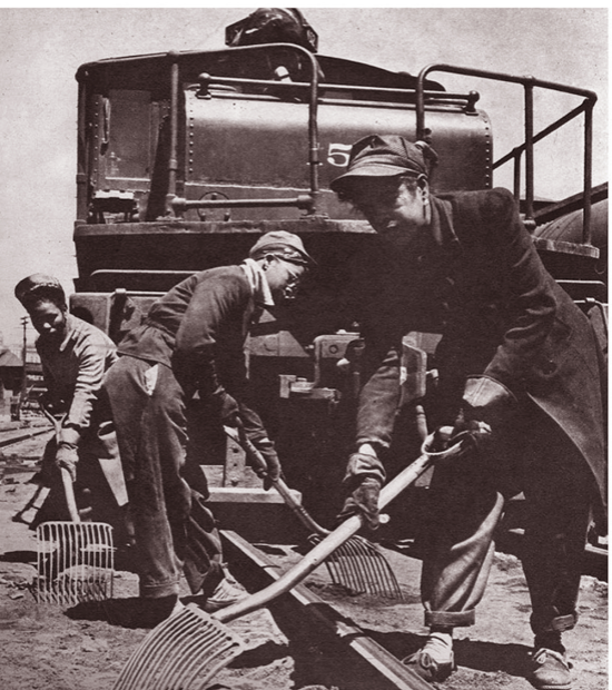
TRACK GANGS OF FIVE TO 20 GIRLS KEEP THE RAILROAD YARDS NEAT AND SAFE BY CLEANING UP DEBRIS