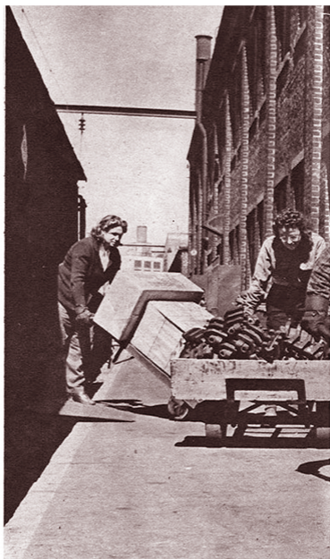
TRUCKERS WHEEL REPAIR PARTS FROM FREIGHT CAR TO STORES DEPARTMENT OF PENNSYLVANIA RAIL YARD.