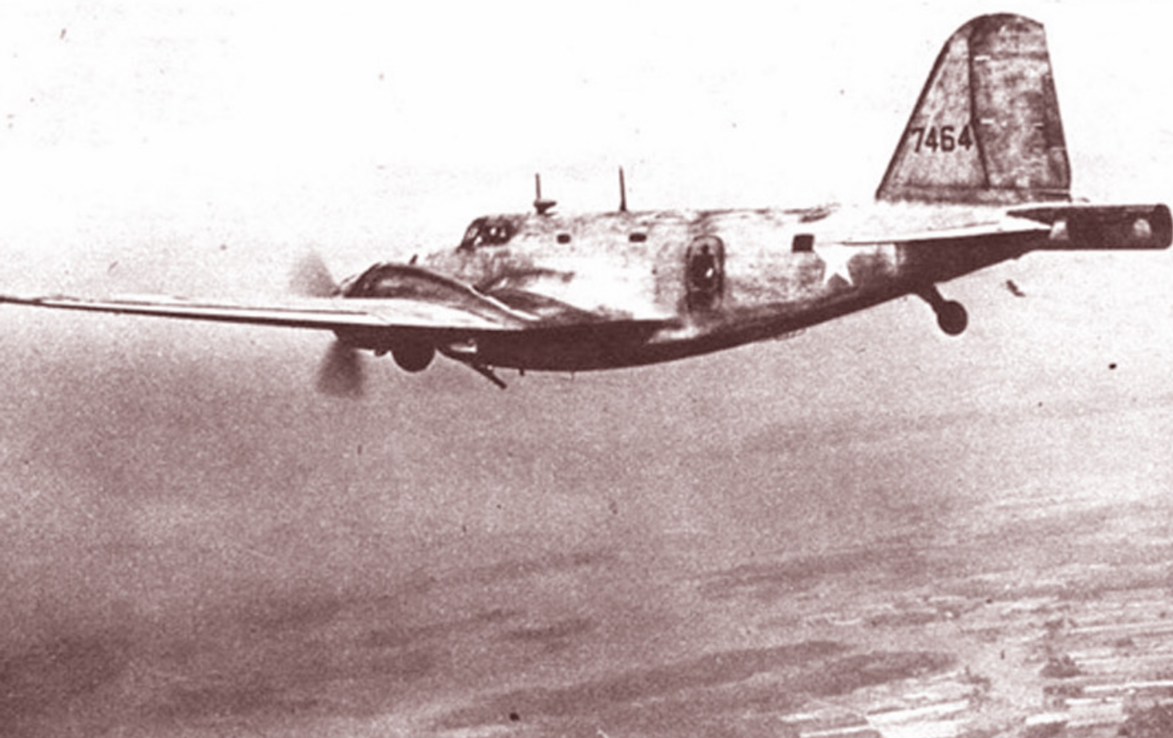
PIGEON IS SEEN directly below the tail of the plane. As bomber pulls away from him, he circles once, then heads straight toward the home loft. Science can't explain homing instinct