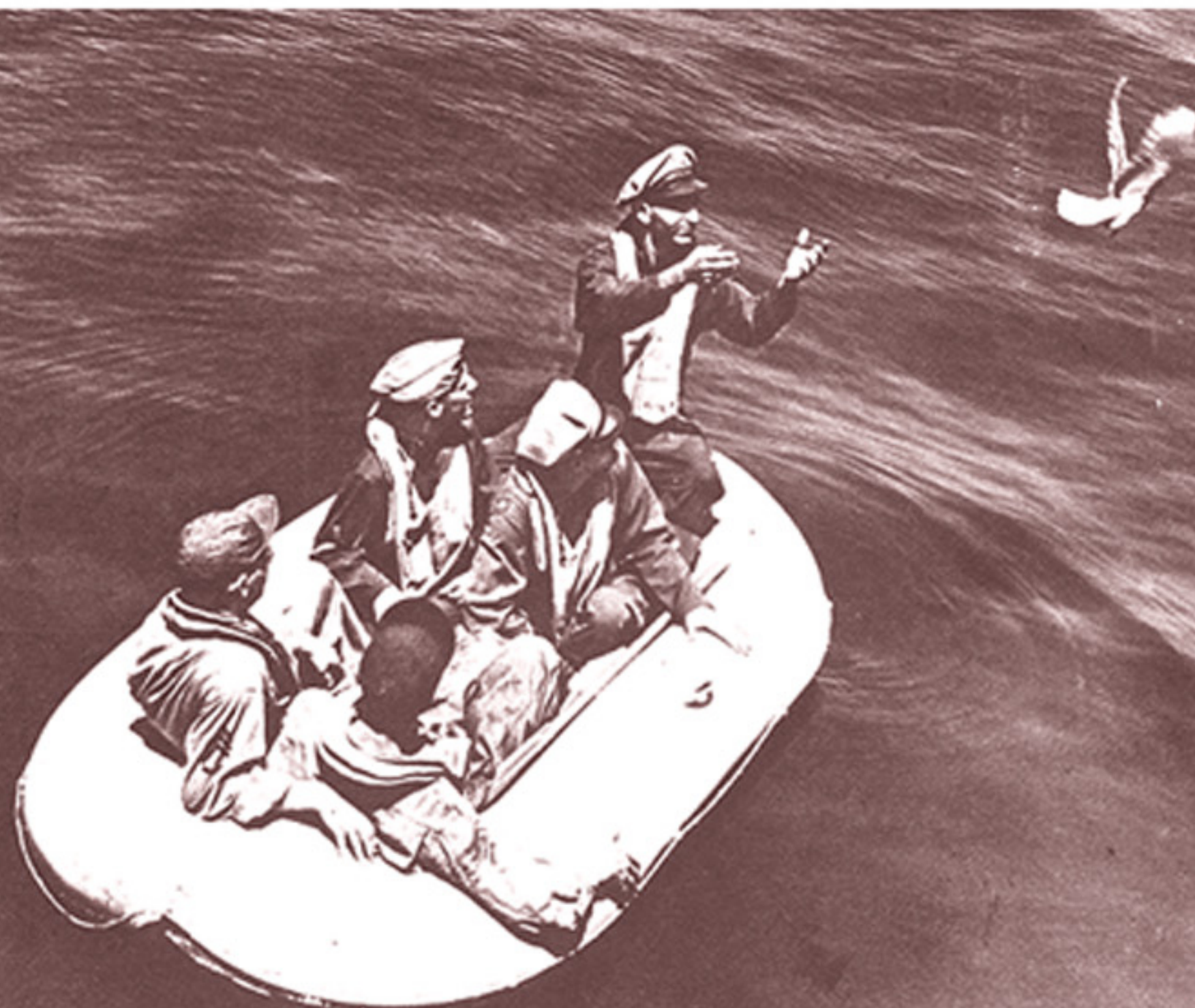
RUBBER ARK SENDS FORTH A DOVE. BOMBER CREWS, FORCED DOWN AT SEA, REPORT POSITION BY COURIER. A RADIO WOULD BETRAY THEIR LOCATON TO ENEMY SUBS