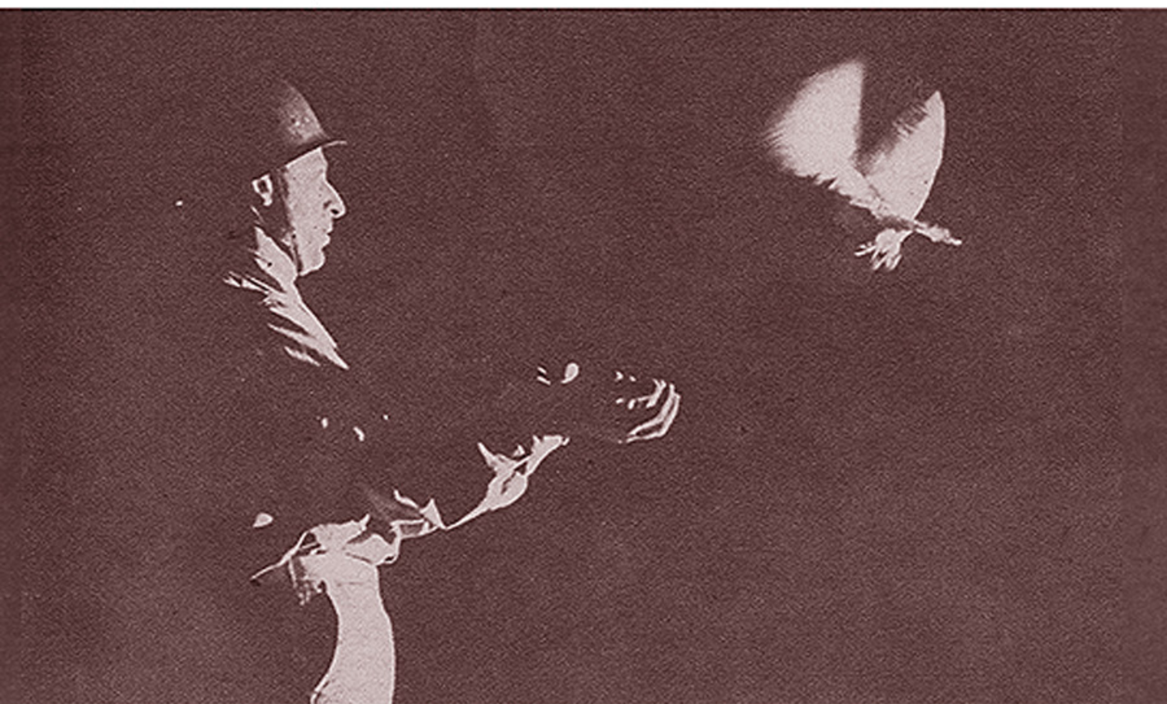
NIGHT FLIGHT: 14 years of experiment and breeding have given the U. S. Army a night flying pigeon. Here Staff Sergt. Charles Purpura releases one for test flight.