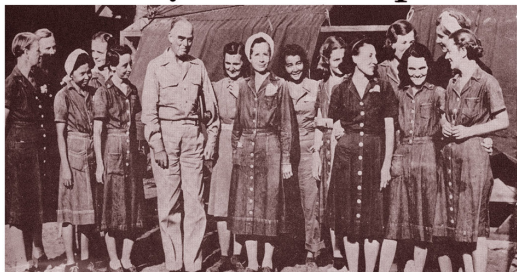
Below: Dramatically rescued after 37 months as prisoners of the Japs, these Navy Nurses were awarded the Bronze Star. Photographed with Admiral