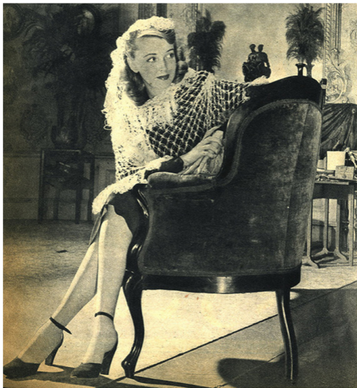
THIS WOOL FASCINATOR ADDS WARMTH WITHOUT WEIGHT