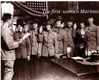
The first women Marines