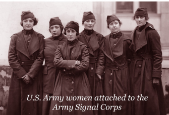
U.S. Army women attached to the Army Signal Corps

aviation program. The board in charge of aviation spent weeks perfecting the plans. It could not, however, take steps to realize them until the council had accepted them and Congress voted the funds.