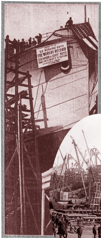
The U. S. government shipbuilding yards at Hog Island at the height of war-time activity

"There are mighty fleets of those ships rusting away today in the Potomac and Hudson Rivers. There they are, aces we never had to use because the other fellow knew we had 'em, and gave up the game. But if we hadn't had 'em—"