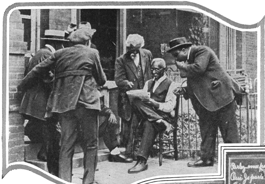
One of the greatest benefits to the negro and the country growing out of the war is the increased interest of the negro in his citizenship. The daily and periodical press is followed more closely than before.

But far greater than all this is the negroes' awakened sense of citizenship. They have been serving under the American flag in a foreign land and that flag, perhaps for the first time, has become wholly and richly theirs. They will come home realizing that their country is a truly great one, proud of them and a fitting object of their pride. They have sat in on the greatest game in our history and learned to serve honorably in a great and unselfish cause, one in spirit with all of us. The reaction of this point of view on the folks at home will be profound, and it will inevitably go a long way toward healing old wounds and creating a better understanding and cooperation in this democracy.