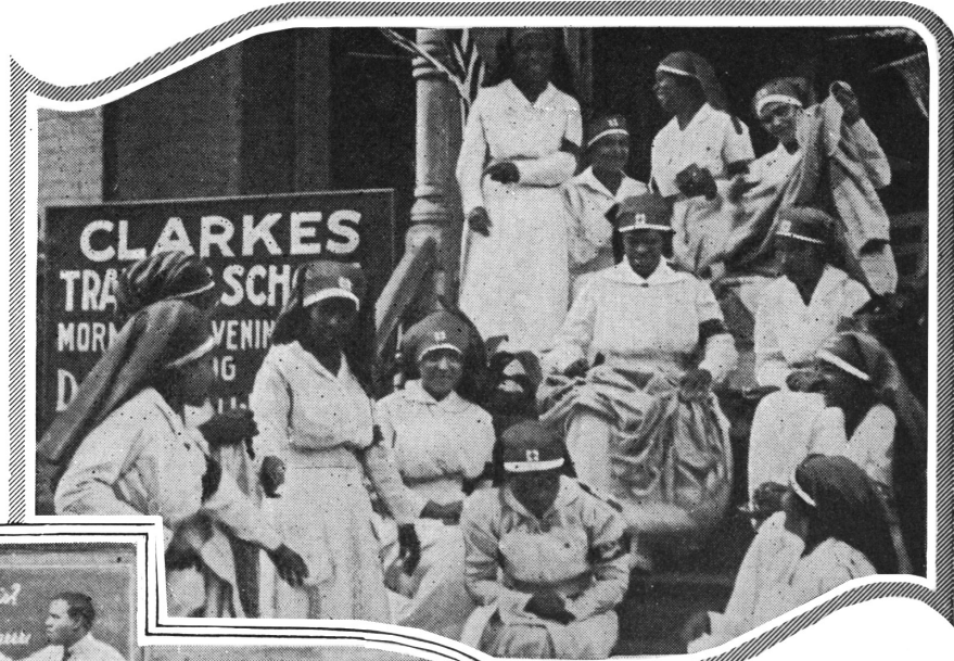
The colored chapters of the Red Cross have been particularly active, and the women have entered the war with the same enthusiasm and resolve to see the struggle through that the negro soldiers have shown.