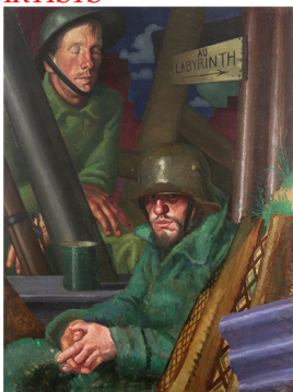
"The Captive," a study of a boche prisoner in Flanders, painted by Colin W. Gill

The series of exhibitions devoted to war subjects seen from time to time in the leading London galleries drew