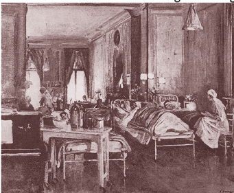
"A London Drawing-room, — wartime," by Sir John Lavery, A. R. A., shows the interior of a great West End mansion converted to military hospital use