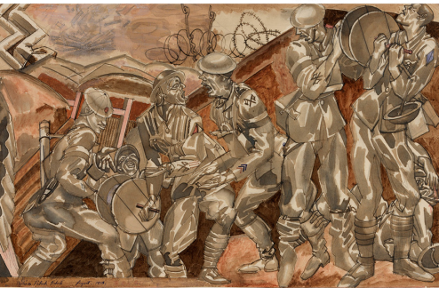
"Signallers," by the Vorticist, William P. Roberts, has the spirit of humor as well as that of modernism

The seemingly crude, almost achromatic canvases of Mr. Paul Nash depict what may perhaps be described as nature's dance of ( Continued on page 72 )