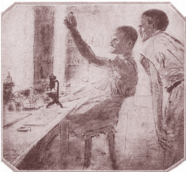
"Bacteria," by James McBey, is a study of British doctors in a laboratory in Palestine making tests to help fight enemies as subtle and deadly and almost as loathsome as the Huns