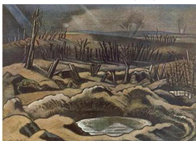
"The Field of Passchendaele," by Paul Nash