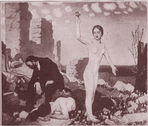
"Renaissance," by George Clausen, R. A., depicts the spirit of new Belgium arising anew from the slaughter and ruin of the old

WHILE it is a matter of interest that Michelangelo reconstructed the defenses of Florence and filled the post of General and Inspector of Fortifications, and Leonardo designed engines of destruction, and was a pioneer in the province of aeronautics, their contribution to the cause of war was made as men of creative genius and not, primarily, in the capacity of artists. It has re-