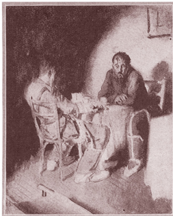
"Two R. F. C.'s (Royal Flying Corps Officers) having breakfast," by Major Sir William Orpen, R. H. A., just wounded, A. R. A., R. H. A.

mained for the present generation of militarists to utilize the artist, as such; and one of the significant points brought out by the current struggle is the fact that artists and artistic principles are capable of playing a vital part in the conduct of war. We have discovered during these latter days that, in order to wage war in all its refinement and nuances, it is necessary to go to school to nature, to co-