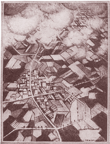
"Flanders from the clouds," as it looks to a cubist artist in an airplane,—by Nevinson

While there is scarcely a nation represented in the great conflict of nations that did not in some manner employ the fundamentals of color concealment and protective mimicry, it must not be assumed that this is the only artistic innovation directly traceable to the war. The most significant departure would, however, seem to lie not in the adaptation of artists and art formulae to the rigorous exigencies of war, but in the recognition accorded the artist as the true historian, the veritable interpreter, of war in all its visible aspects.