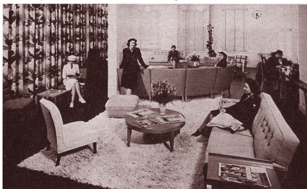
WAVES AND WAACS LUXURIATE IN FRILLY FEMININE LOUNGE ROOM.