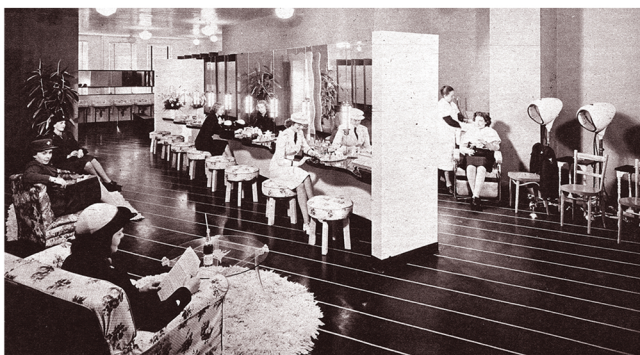
MOST POPULAR SPOT IN SAN FRANCISCO WOMAN'S SECTION OF THE CENTER IS THE BEAUTY PARLOR AND THE MAKE-UP BAR

Movie splendor is now provided for Waacs and Waves in big new canteen