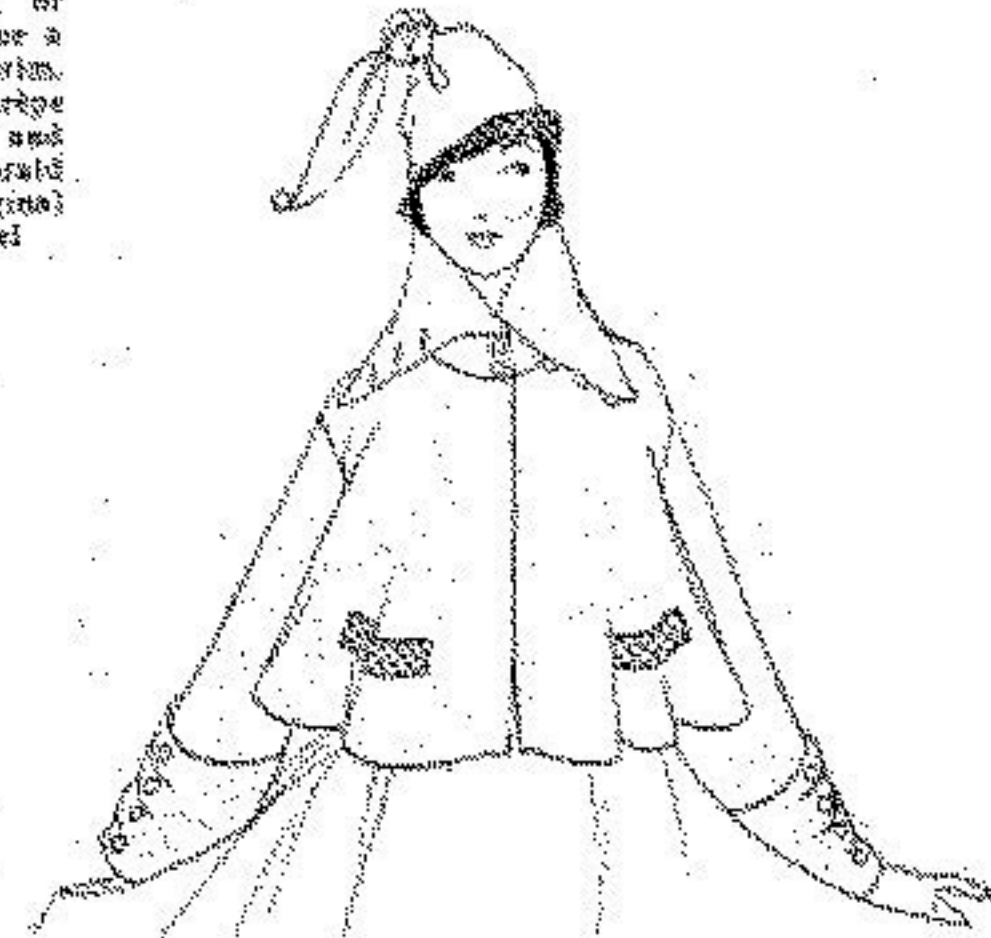
Sports in the country shall shortly entertain this gay new type of jacket and cap made of India blue jersey cloth and designed by Lucie Hamar. The hat is knotted at the tip of the crown, tapering to a pointed end and its brim is lined with rough sea grass. The loose coat is simply provided with cuffs and collar, its only foreign trimming being two little pocket tabs of grass. All models except one at upper left imported by Clairville, Inc.