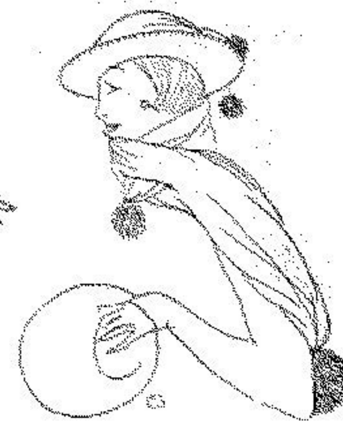
A Wedgwood green jersey cloth scarf has a chiffon lining and repeats its color. The hat, to match, is buttonholed with wavyband. Lucie Hamar model