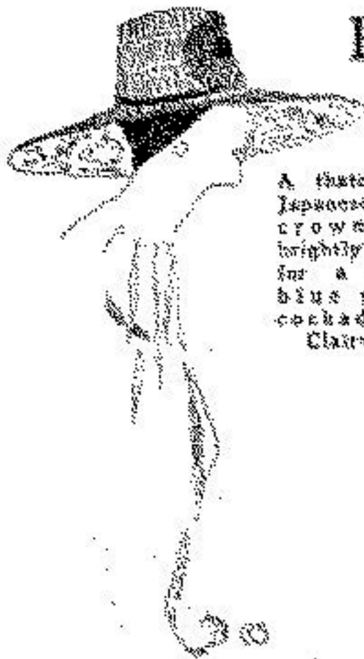
A thatched roof of Japanese straw for a crown and trim, brightly figured edge for a facing and blue satin braided cascade. Original Clairville model