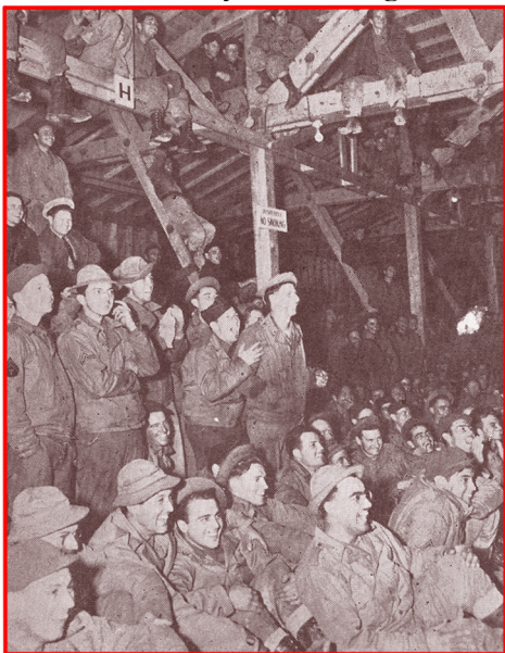
GI audience in Alaska: USO-Camp Shows travel the world's greatest circuit

Somewhere in England 108 USO-Camp Show performers last week awaited their own D Day. Equipped with regular officer's field equipment, including bedrolls and tents, they were ready to cross the Channel when—and only when—the Army should decide it wants and needs them. (Camp Shows overseas are under the jurisdiction of area commanders.) That they had been held back thus far probably was partly because of the odd fact that morale needs less boosting at the front than in quieter zones remote from battle lines.